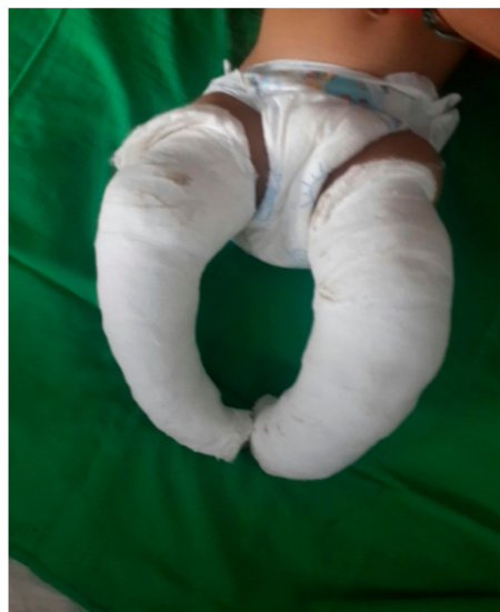
Figure 3. First cast for cavus correction.