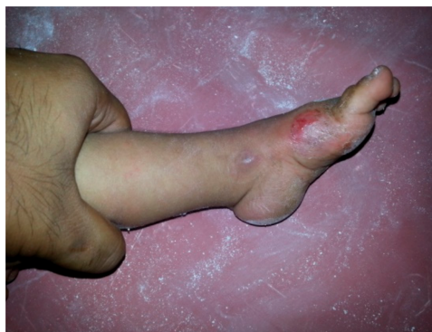
Figure 10. Skin abrasions.

In our series, a few minor complications were encountered during the casting procedure which included skin abrasions, cast saw injuries, cast loosening and cast breakage (Figures 10 and 11).