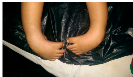
Figure 1. Initial presentation.

Casting was begun as soon as possible when the children came to us for treatment. In all the infants, the Pirani scoring was done to assess the initial severity. Weekly follow up were undertaken during the initial periods of bracing to ensure compliance and to periodically assure and educate the parents. Later, after the application of a Dennis Brown (DB) splint, a monthly follow up was advised for three months and then up to 4 years.