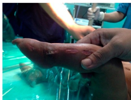
Figure 11. Cast saw injury.