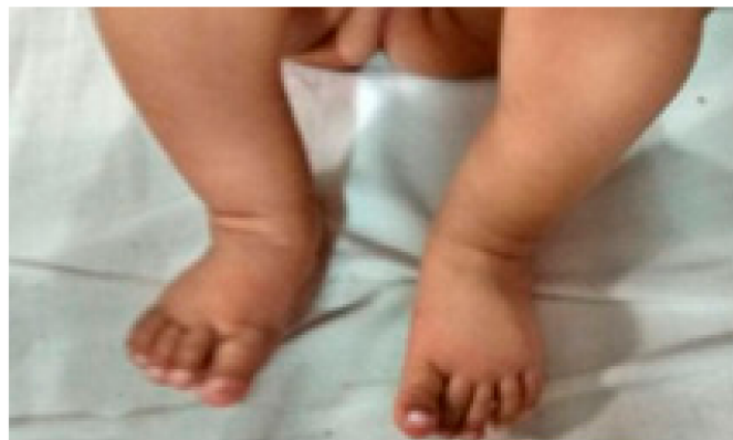
Figure 8. Clinical picture at last follow up.