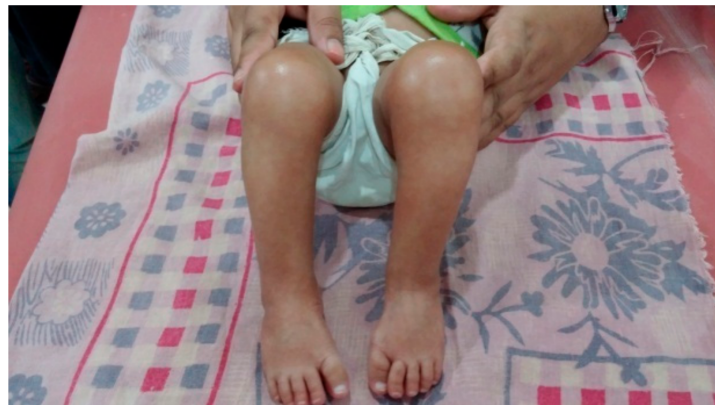
Figure 5. After removal of fourth cast.