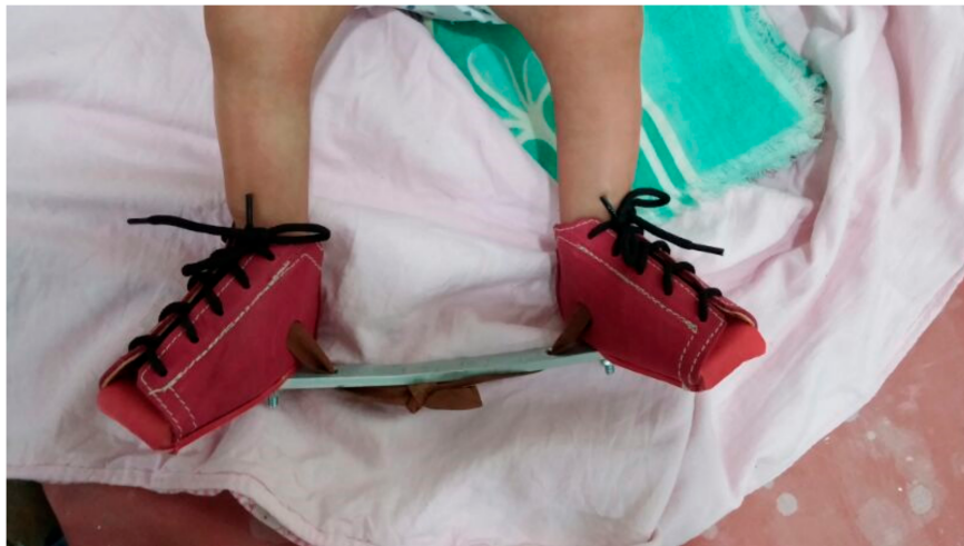
Figure 7. Dennis Brown (DB) splint and shoes.