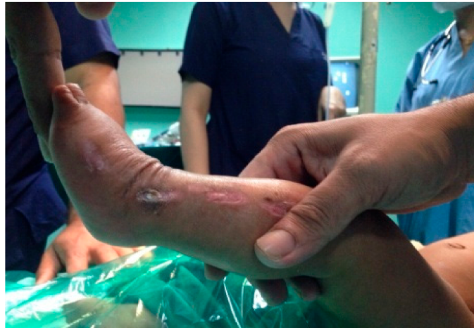
Figure 2. Manipulation.