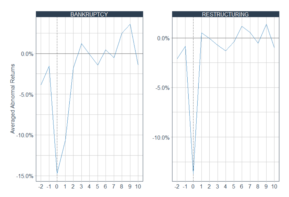
Figure 2. Average rates of return in the test window depending on the type of application submitted.

All the tests used show statistically significant, at the highest tested \alpha level, abnormal rate of return on the day of announcing the information. The division into restructuring or bankruptcy procedure is not an important factor that can produce various results at the event date. Four in five tests also yield statistically significant values at day (-2). That indicates that investors anticipate future bad news. However, on that day, the results are not as unambiguous as at the event date. For bankruptcy procedure, it can also be noted that a statistically significant negative rate of return occurred one day after the event (this is showed by three used tests). An explanation for that can be the fact that, for some companies, information about that procedure was announced at the end of the working hours of the WSE, and the reaction was postponed to the day after the event.