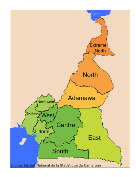
Figure 1. Regional distribution of Cameroon.

The sample consisted of 120 Baka pygmy children aged 5–6 years and 11–12 years selected according to non-exhaustive consecutive sampling. All children whose parents or legal guardians signed a consent form and who fell within the determined age ranges participated in the study.