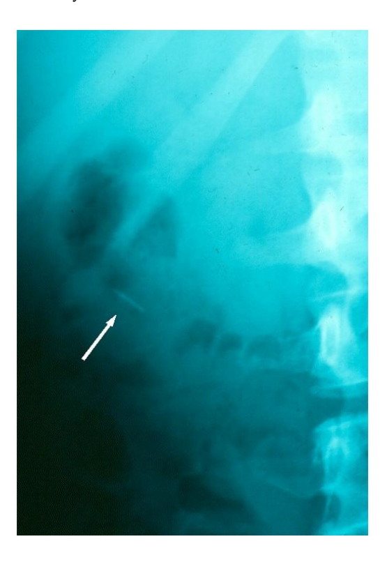
Figure 2. Radiographic tracking view, confirming the archwire fragment location in the colon, during its safe passage through the GIT.

archwire fragment had passed safely and uneventfully through the gastrointestinal tract (Figures 2 and 3). Following discharge there was rapid recovery to full health. Orthodontic treatment was resumed and completed successfully without further incident.