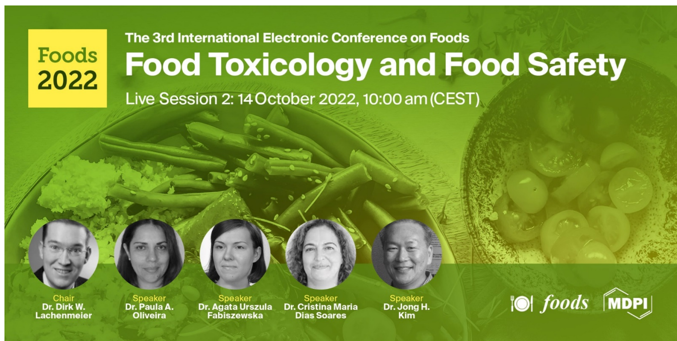
Figure 2. Speakers of the Foods 2022 Conference live session 2 on food toxicology and food safety.