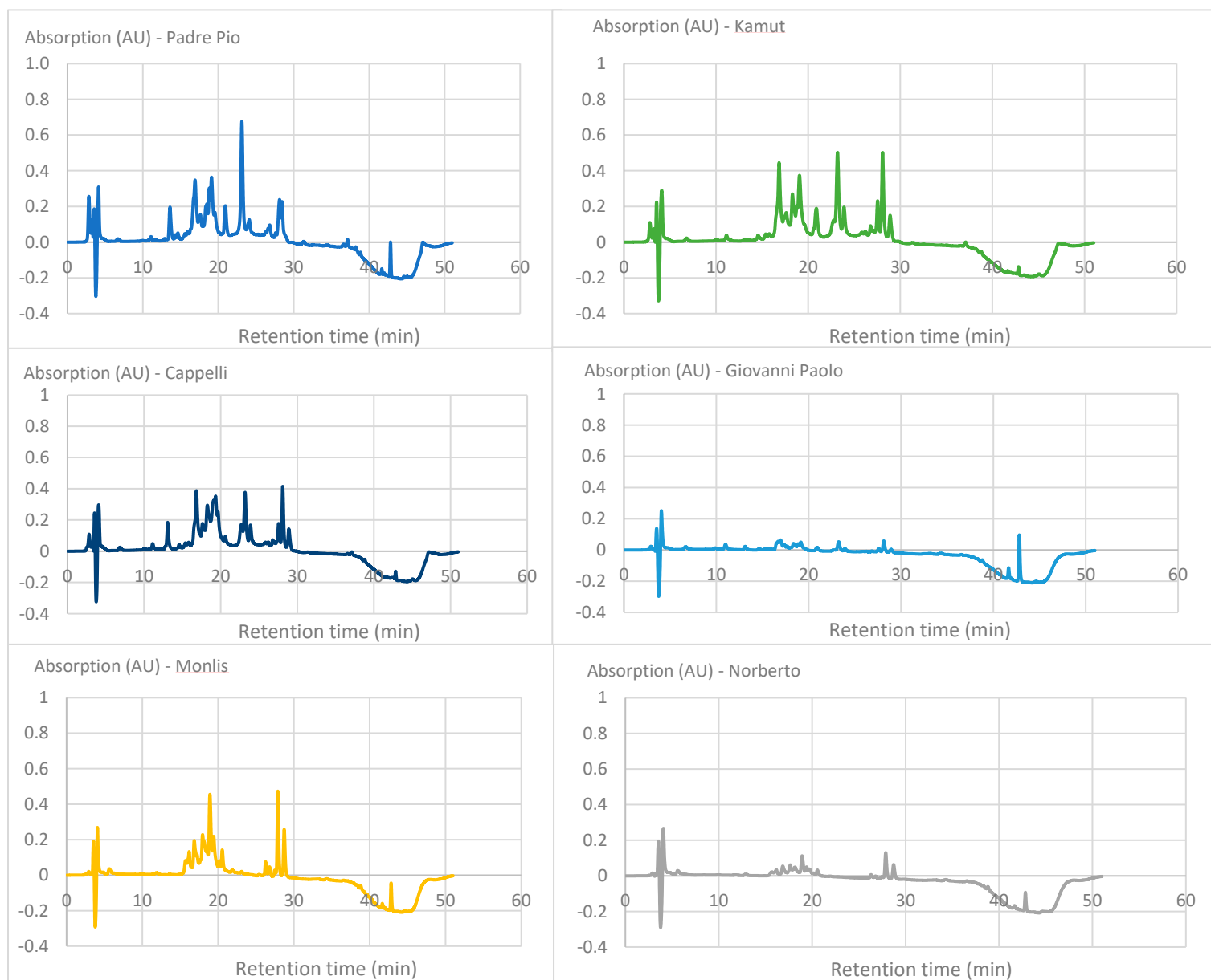
Figure S1. RP-HPLC chromatograms representing the area under the curve of the gliadins during the 60 minutes of separation of the six cultivars studied, Padre Pio, Norberto, Monlis, Giovanni Paolo, Kamut and Cappelli.