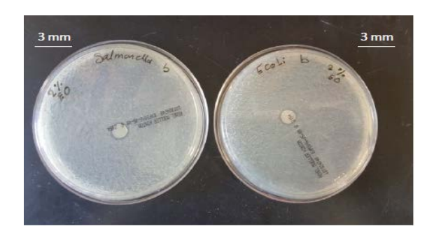
Figure 4. Antibacterial activity of sweet potato starch-based nanocomposite films with montmorillonite nanoclay and 2% ( v / v ) thyme essential oil against Escherichia coli and Salmonella Typhimurium .