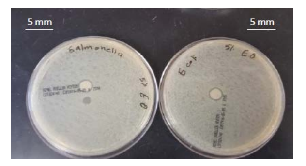
Figure 5. Antibacterial activity of sweet potato starch-based nanocomposite films with montmorillonite nanoclay and 4% ( v / v ) thyme essential oil against Escherichia coli and Salmonella Typhimurium .