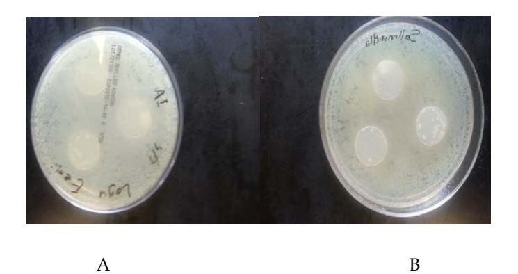
Figure 3. Antibacterial activity of sweet potato starch-based nanocomposite films with montmorillonite nanoclay and without thyme essential oil, agaisnt ( A ) Escherichia coli ( B ) Salmonella Typhimurium .