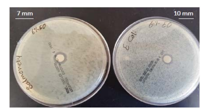
Figure 6. Antibacterial activity of sweet potato starch-based nanocomposite films with montmorillonite nanoclay and 6% (v/v) thyme essential oil against Escherichia coli and Salmonella Typhimurium .