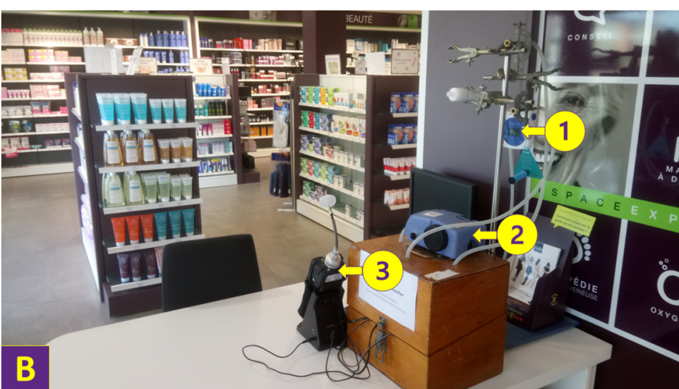
Figure 1. Examples of the flow rate measurements of an air vent in the refectory of an elderly care facility ( A ), and of the CO_2 (1), PM_{2.5} (2) and TVOC (3) measurements in the commercial space of a pharmacy ( B ).

The activities performed and the number of persons in the rooms were not recorded in real time during the study.