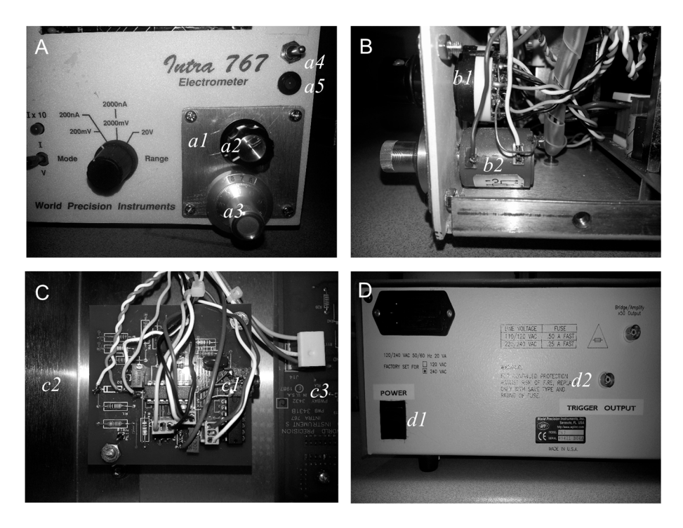
Figure 2. WPI electrometer panel modifications. ( A ), The front panel power switch has been removed and fixed to the back panel of the instrument. In its place is an aluminium panel ( a 1) onto which is fixed the 10-turn (10k) potentiometer ( a 2) and 6-position function switch (SW2A,B; a 3). The power switch (SW1; a 4) and the LED monitor ( a 5) are mounted to the right of the panel. ( B ), Side-on view of the 10-turn potentiometer ( b 1) and the function switch ( b 3). ( C ), Pulser printed circuit board (PCB) ( c 1) mounted inside the WPI Intra 767 case between power supply section at left ( c 2; not shown) and main circuit board ( c 3). Note that this is a working prototype but is not the final PCB design available in the Supplementary files.( D ), Rear panel showing new location of main power switch ( d 1) and trigger output connector ( d 2). LED = Light Emitting Diode.

Behind the front panel of the Intra 757 is a printed circuit board on which are mounted the controls that appear on the front panel of the instrument. The only available "free" space on the front panel for addition of the power switch (SW1), function selector switch (SW2A & 2B), monitor LED (light emitting diode) and the current pulse amplitude control (VR1) is at the position of the main power switch of the Intra 767. Therefore, the power switch was relocated to the back panel. A piece of aluminium panel was fixed into place over the gap left after removal of the power switch. This was then used to fix the controls (VR1 and SW2) required for the pulser circuit while the monitor LED and power switch (SW1) are located above this panel (see Figure 2).