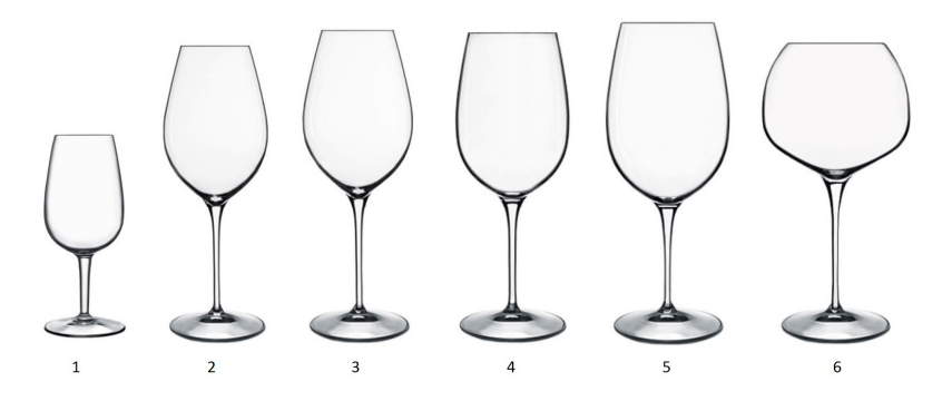
Figure 1. Glasses tested for the experimental trials (see Table 1 for details).

* Maximum diameter divided by opening diameter.