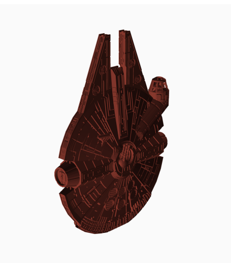
Figure 2. fillenium malcon, by aaskedall.