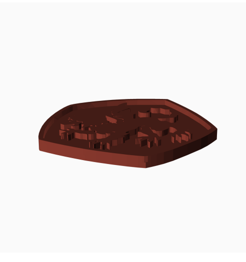
Figure 1. Royal manticore navy, by jamesH.