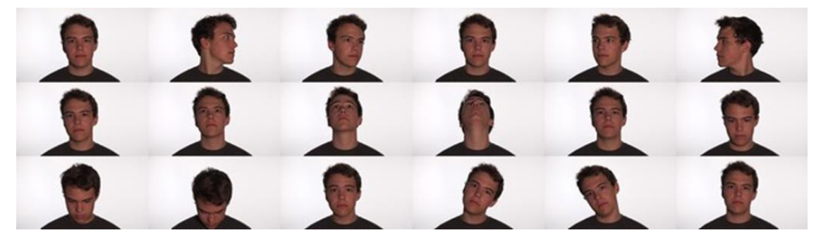
Figure 3. Subjects were told to position their head in multiple orientations, for one second at a time, during video recording.

The subject was told to move their head after immediately upon hearing a metronome-like clicking sound. The time between each tick was one second. Because of this, each subject spends approximately the same amount of time facing in each position and moving between positions. This allows the impact of the lighting conditions on different facial recognition algorithms to be compared in terms of aggregate face detection time, as each view of the subject's face was visible for the approximately the same amount of time in each video. Figure 3 depicts the various positions each subject positioned his head in.