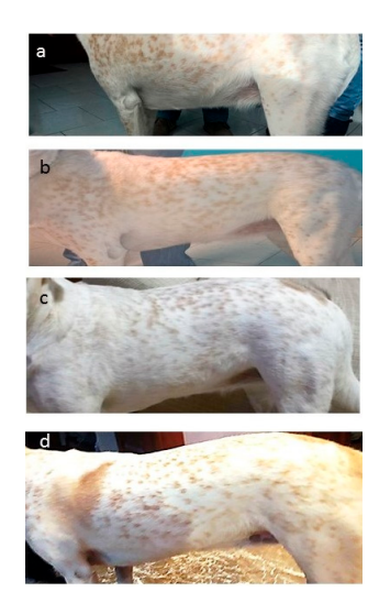
Figure 2. Lara's left lateral view (non-standardized picture, according to Gant and others, 2016 [24], at admission ( a ), and after 4 ( b ), 10 ( c ) and 16 ( d ) weeks from the beginning of the weight loss programme. As with the dorsal photography it is clear how BCS and body shape changed over time. Notice the abdominal distension in Figure 2 a (BCS: 7–7.5/9) and lack of an abdominal tuck, then the appearance of an abdominal tuck in Figure 2 d (BCS: 5/9).

Figure 1. Lara's dorsal view (non-standardized picture, according to Gant and others, 2016 [24], at admission ( a ), and after 4 ( b ), 10 ( c ) and 16 ( d ) weeks from the beginning of the weight loss programme. Despite the non-standardized method of photography, it is clear how the body condition score (BCS) and body shape changed over time. Notice the absence of a waistline and the fat deposit over the lower back in Figure 1 a (BCS: 7–7.5/9) and then the visible waist in Figure 1 d (BCS: 5/9). The scoring system was: ideal weight (BCS: 4–5/9), overweight (BCS: 6–7/9), and obese (BCS: 8–9/9) [24].