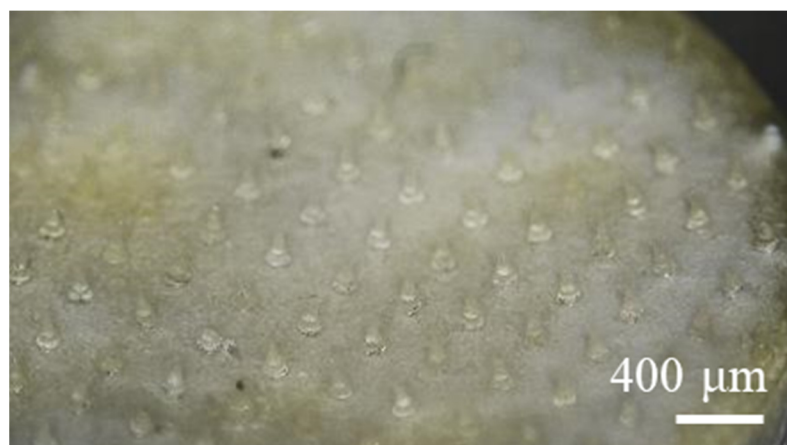
Figure S2. The appearance of the type 3 MNs with a “cake-like” structure after skin insertion.