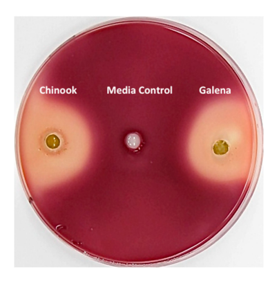
Figure 2. Antimicrobial activity of stored hops against Clostridium sticklandii SR. Basal medium agar (1.5% w/v) was amended with Trypticase (15% w/v) as a growth substrate and inoculated (1% v/v, 48 h culture) at pouring temperature. The plate was poured in an anaerobic chamber (95% CO<sub>2</sub>, 5% H<sub>2</sub>) and allowed to set. Wells were made in the agar with a sterile glass tube, and filled with basal media (100 µL) that had been steeped (12 mg mL<sup>-1</sup>, 2 h, 24 °C) with Chinook (left), the media carrier only (center) or Galena hops (right). The plate was incubated (24 h, 39 °C) in the anaerobic chamber and living cells were stained with tetrazolium red (CAS 298-96-4).

The model rumen HAB, Cl. sticklandii SR, rapidly colonized basal medium agar when peptides were present as a growth substrate. When agar Petri plates that had been incubated overnight (39 °C) were treated with 2,3,5-triphenyltetrazolium, living cells took up the dye and stained red (Figure 2). Zones of growth inhibition were caused by the addition of liquid media that had been steeped with either variety of hops (12 mg mL<sup>-1</sup>, 2 h, 23 °C) to wells in the agar. Control wells that held unamended media did not show inhibition. The inhibitory activity of the hop pellets was also tested in broth culture (data not shown). Hop concentrations as low as 1.5 mg mL<sup>-1</sup> a- and 51 mg L<sup>-1</sup> \beta -acids for Chinook, and to 201 mg L<sup>-1</sup> \alpha - and 129 mg L<sup>-1</sup> \beta -acids for Galena. Note that this was the lowest concentration tested, not a minimum inhibitor concentration.