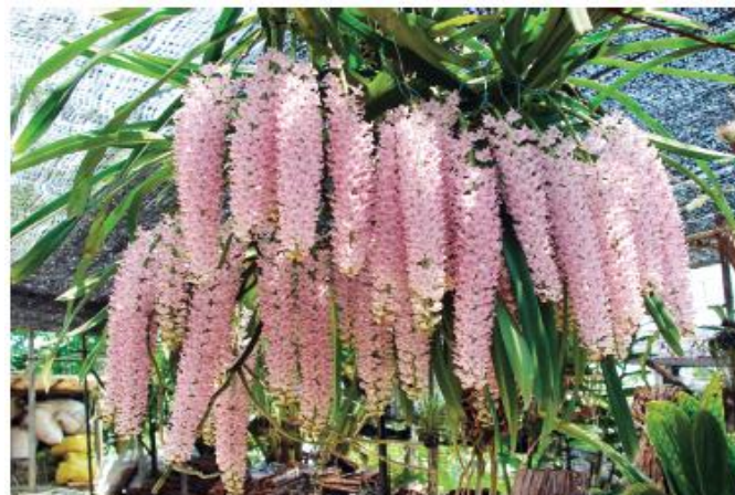
Figure 5. Rhynchostylis retusa .