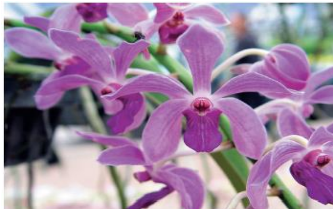
Figure 7. A hybrid of Rhynchosstylis gigantea and Vanda coerulea .