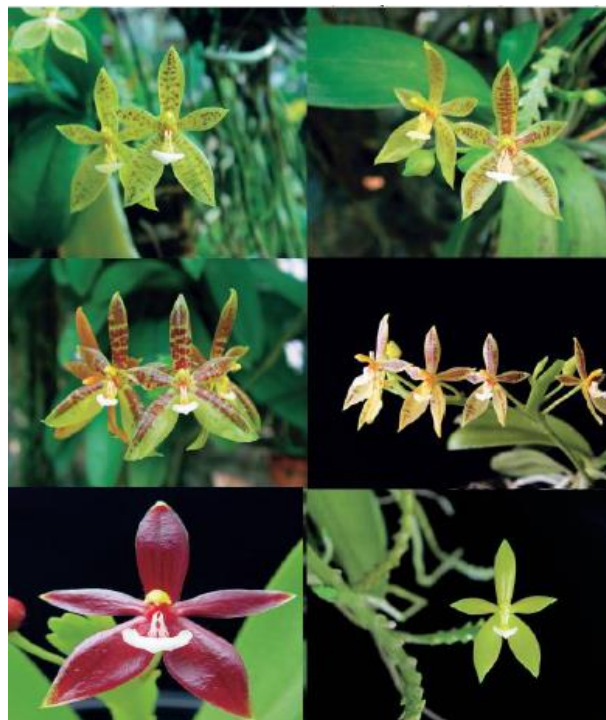
Figure 11. Variation in flower color of Phalaenopsis cornu-cervi .

This genus (Figure 11) is a short epiphyte and monopodial orchid with long leaves. It has one to many flowers per spray, and some continuously bloom one at a time. This genus, especially for its hybrids (Figure 12), is economically important in Taiwan.