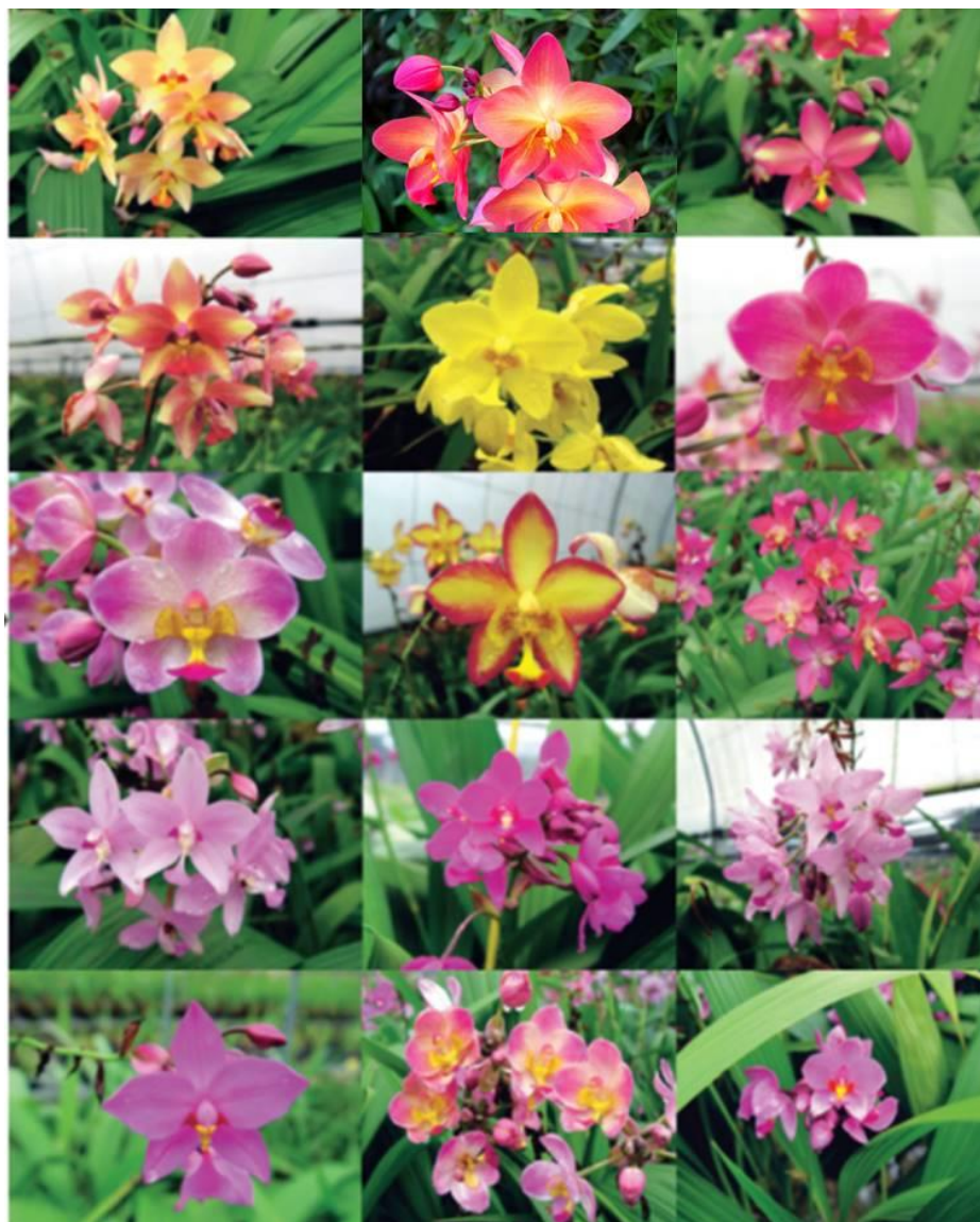
Figure 20. Spathoglottis hybrids.