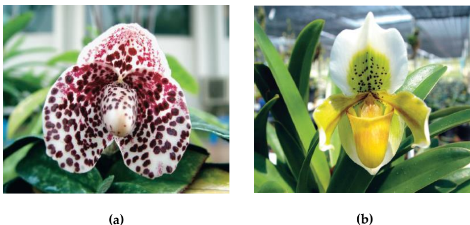
Figure 21. Paphiopedilum bellatulum (a) and Paphiopedilum exul (b).

This genus is called “Lady’s slipper” because the lip looks like lady’s shoes. There are 15 species reported in Thailand. They are popular to grow from seeds as potted plants. The popular species used for trade are P. bellatulum (Figure 21a), P. concolor , P. exul (Figure 21b). P. godefroyae , P. niveum , P. callosum , P. parishii and P. hirsutissimum .