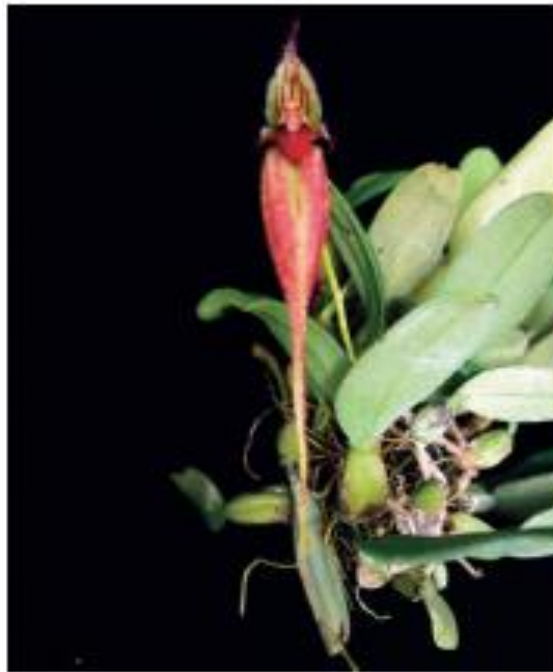
Figure 17. Bulbophyllum putidum .