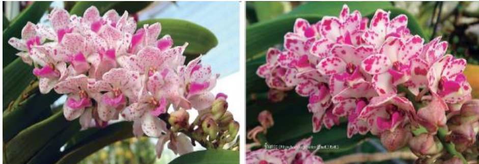
Figure 4. Rhynchostylis gigantea .

This genus is epiphytic, monopodial, and has medium to large stems with thick leaves. In Thailand, there are 3 species in this genus, namely R. gigantea (Figure 4), R. retusa (Figure 5) and R. coelestis (Figure 6). The flower colors of Rhynchostylis gigantea are white, white with red-purple spots, red-purple and orange. This genus is popularly grown as potted plants and as parents for producing interspecific hybrids (Figures 7 and 8).