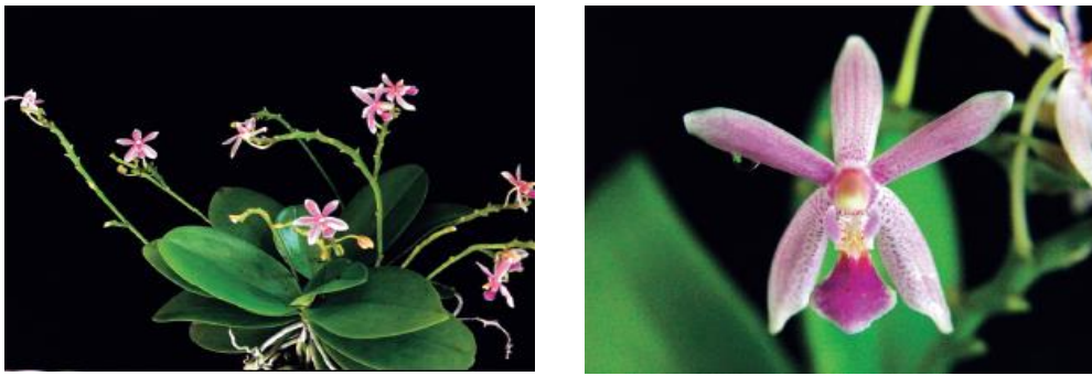
Figure 12. Phalaenopsis hybrids.