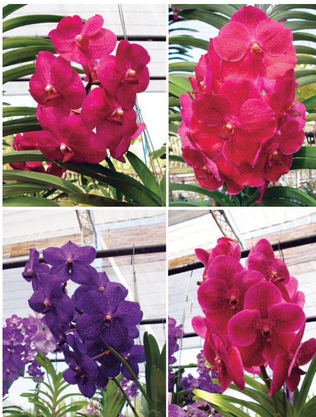
Figure 3. Vanda hybrids.