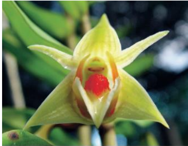
Figure 15. Dendrobium cruentum .

This genus (Figure 15) is a sympodial orchid with diversity in size and shape of stems, leaves, its habitats and growth habits. They are over 1000 species in the genus around the world. They are popularly grown and used in breeding to get outstanding hybrids (Figure 16).