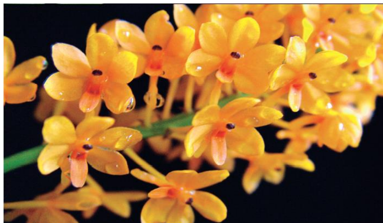
Figure 9. Ascocentrum miniatum .

This genus is a small epiphyte and monopodial orchid with 3 types of flower color, purple-red ( A. ampullaceum ), red ( A. curvifolium ), and orange ( A. miniatum ) (Figure 9).