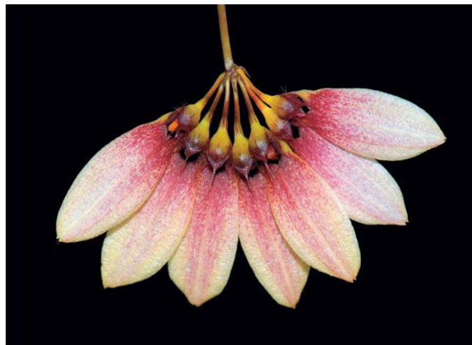
Figure 18. Cirrhopetalum lepidum .

This genus (Figure 18) was separated from Bulbophyllum because its dorsal sepal is smaller than the lateral sepals. The flower spray is umbellate and the pseudobulb is cone shaped.