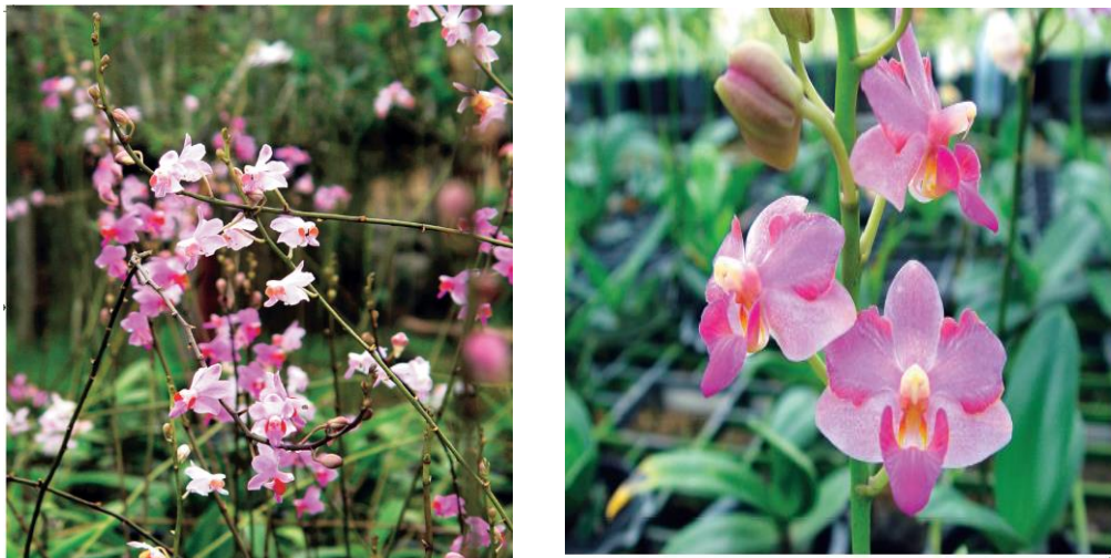
Figure 13. Doritis pulcherrima .

This genus (Figure 13) is terrestrial and can grow in sand or rock. Its sprays are straight and hard with 5–15 flowers which continuously bloom for 5–6 months. It grows easily as a potted plant and has been crossed with Phalaenopsis to get a medium-sized straight flower spray (Figure 14).