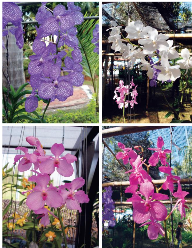
Figure 2. Variation in flower colors of Vanda coerulea .