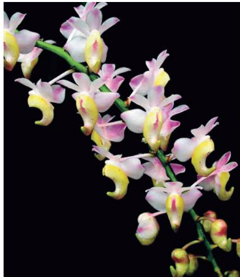
Figure 10. Aerides odorata .

This genus (Figure 10) is a small epiphyte and monopodial orchid and can grow in strong sunlight. It has beautiful flowers and sprays, so it is popular for hobbyists to grow and use for orchid improvement.