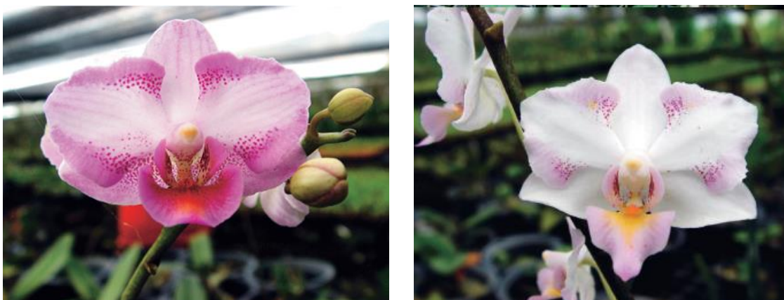
Figure 14. Doritis hybrids.