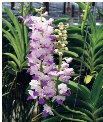
Figure 6. Rhynchostylis coelestis .