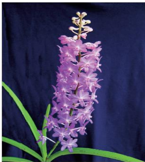
Figure 8. A hybrid of Rhynchosstylis coelestis and Seidenfadenia mitrata .