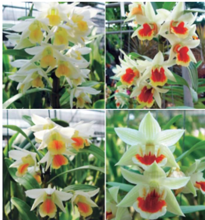
Figure 16. Dendrobium cruentum hybrids.