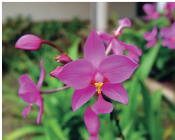
Figure 19. Spathoglottis plicata .