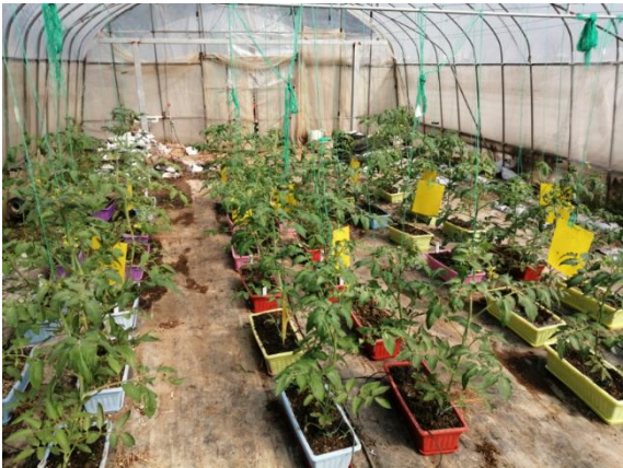
Figure S1. The experimental schemes and pictures