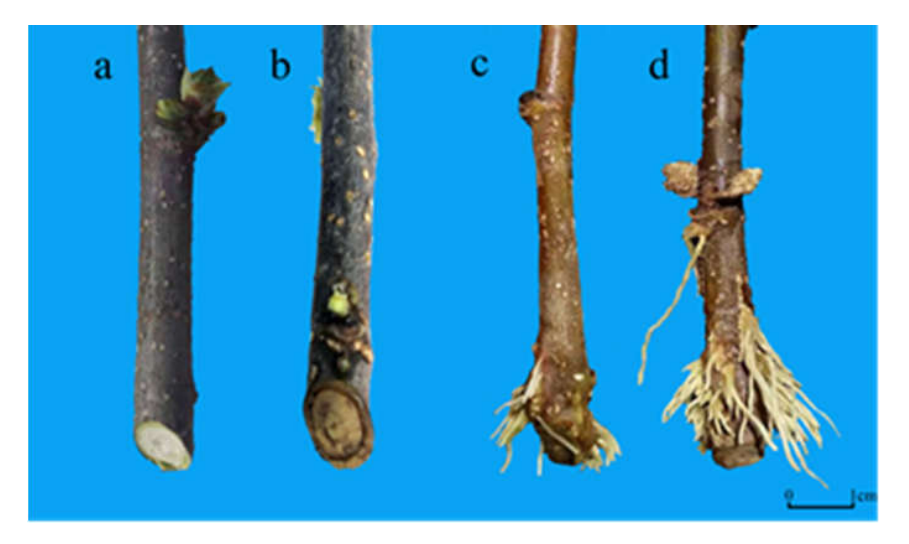
Figure 2. Rooting process of fruit mulberry. (a): 1-day morphology of fruit mulberry cuttings; (b): 18-day morphology of fruit mulberry cuttings; (c): 18–28-day morphology of fruit mulberry cuttings; (d): 28–48-day morphology of fruit mulberry cutting.

Figure 1. Rooting process of vegetable mulberry cuttings. ( A ): 1-day morphology of vegetable mulberry cuttings; ( B ): 18-day morphology of vegetable mulberry cuttings; ( C ): 18–28-day morphology of vegetable mulberry cuttings; ( D ): 28–48-day morphology of vegetable mulberry cuttings.