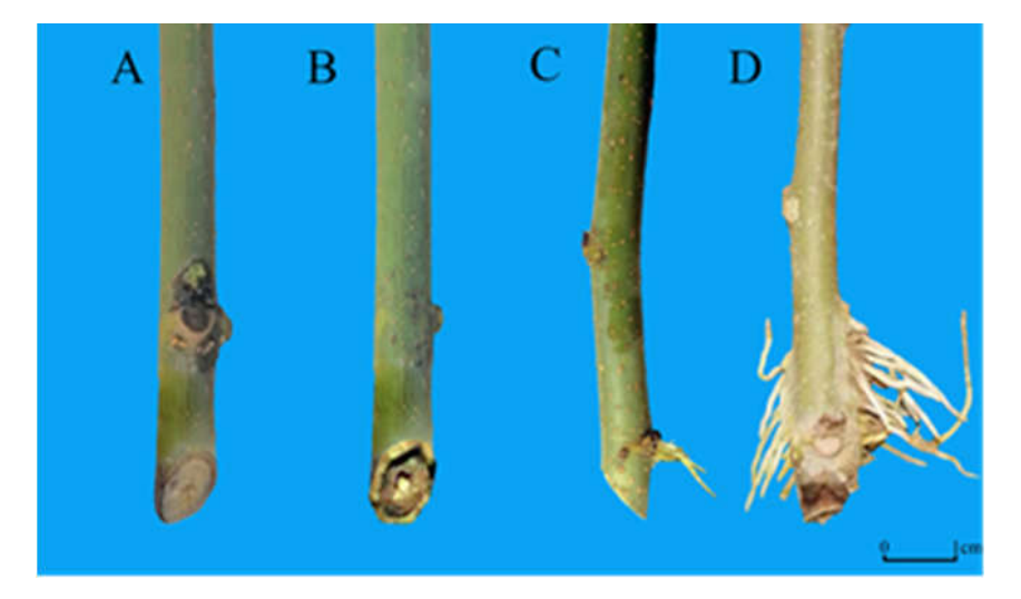
Figure 1. Rooting process of vegetable mulberry cuttings. ( A ): 1-day morphology of vegetable mulberry cuttings; ( B ): 18-day morphology of vegetable mulberry cuttings; ( C ): 18–28-day morphology of vegetable mulberry cuttings; ( D ): 28–48-day morphology of vegetable mulberry cuttings.

As revealed by observation, for the treatment groups of both vegetable mulberry (Figure 1) and fruit mulberry (Figure 2), the incision at the base began to swell and crack to produce callus tissue at 18 days after the cuttings, and adventitious roots started to form and emerge from the bark between 18–28 days after the cuttings. From 28 to 48 days after the cuttings, numerous adventitious roots were generated and continued to elongate. Compared with the treatment group, the control group of vegetable mulberry and fruit mulberry cuttings exhibited later rooting progress. The rooting process of vegetable mulberry and fruit mulberry cuttings could be divided into three stages, namely the initiation stage (1–18 days), the callus tissue generation stage (18–28 days), and the adventitious root generation and elongation stage (28–48 days).