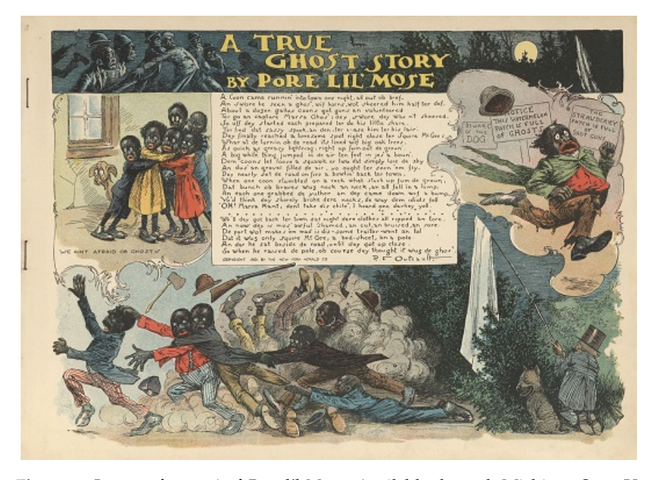
Figure 1. Image of page 4 of Pore lil Mose. Available through Michigan State University Digital Collections: https://d.lib.msu.edu/gnn/1449 (accessed on 4 May 2022).

However, these terms do not always indicate respectful representation of the group in question. Many early comics labeled with these subject terms are pure racial caricature. Take, for example, "Pore lil Mose: his letters to his mammy" from 1902, written by Buster-Brown creator Richard Felton Outcault (1902). It depicts a young Black boy, among other Black characters, in a style akin to that used in minstrel shows. Pore lil Mose writes poems framed as letters to his "mammy," a racist stereotype of Black women domestic workers, in a "Negro" dialect rife with slurs such as "coon" and "darky." (Figure 1).