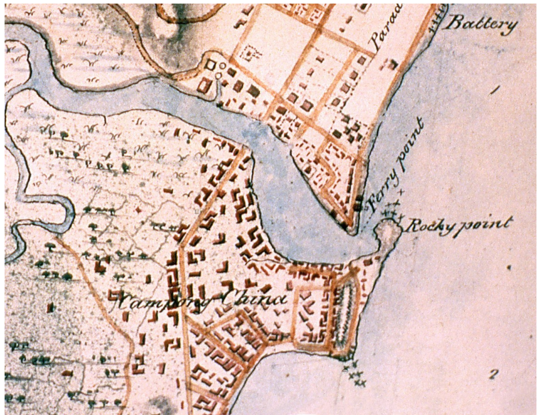
Figure 1. An 1825 map of the mouth of the Singapore River, with Rocky Point, where the Singapore Stone once stood, marked on the right side of the map (noa 1825).

From 1819 onwards, the Stone attracted the attention of both curious locals and visitors with an interest in antiquities. Dr John Crawfurd, who would later serve as the second and last Resident of Singapore, visited the Stone en route to Siam, describing its appearance and theorising that its inscription was in Pali, an Indian abugida and the sacred language of Theravada Buddhism (Makepeace et al. 1921).