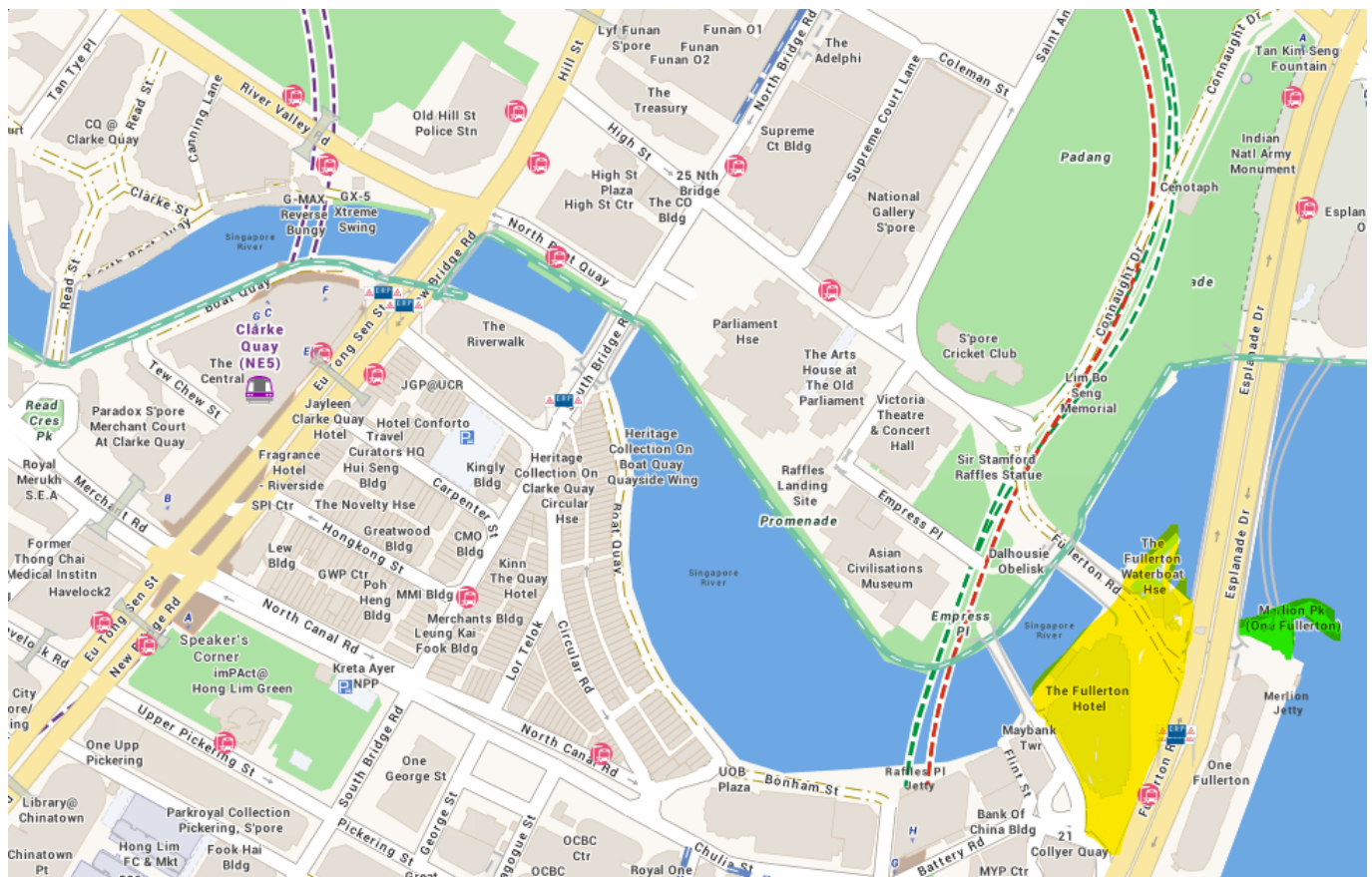
Figure 4. A 2023 map of the mouth of the Singapore River (Urban Redevelopment Agency 2023). Extensive land reclamation and development works have significantly transformed the landscape (as seen in comparison to Figure 1). Where the Singapore Stone once stood on a seafront promontory, the Fullerton Hotel (highlighted in yellow) now stands, overlooking a dammed freshwater basin. The Merlion was originally erected on the site of the Stone before being moved to its present location (highlighted in green) after its view was blocked by the construction of the Esplanade Bridge (major arterial in yellow separating the two sites).

The Singapore Stone has also continued to play a pivotal role in the Singapore story: retellings of the founding of Singapore—including the 2016 National Day Parade—often include the legend of Badang (Yeo 2016). The Stone’s significant historical value has been noted throughout the years, with the National Heritage Board of Singapore naming it one of its most valuable artefacts (National Heritage Board 2007) and placing it in a prominent position near the entrance of its permanent exhibit. The repatriation of the Stone has given to Singapore an imposing visual representation of its rich and storied past, capturing the minds of Singaporeans for years to come.