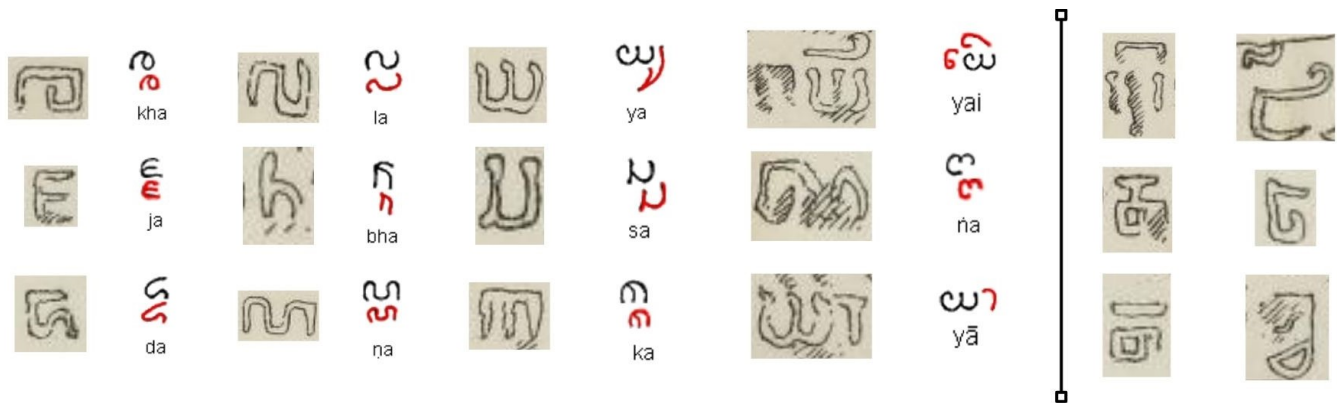
Figure 6. (Left) Selected characters from the Singapore Stone and corresponding Kawi characters (Laidlay 1848; Omniglot 2023). (Right) Characters or inscriptions that are not easily reconciled with Kawi (due to unusual diacritics or consonants).

appear in the Stone's inscription. There is also an unusual double-hooked bar diacritic that appears multiple times on the Stone, with no clear Kawi equivalent. Several consonant characters also do not match Kawi, such as the hooked box topped with a flat line that appears regularly across the three fragments. In general, the Stone's inscription is neatly carved with a less fluid style than the sample Kawi script. This leads to a 'boxy', angular appearance that is distinct from other Kawi writings.