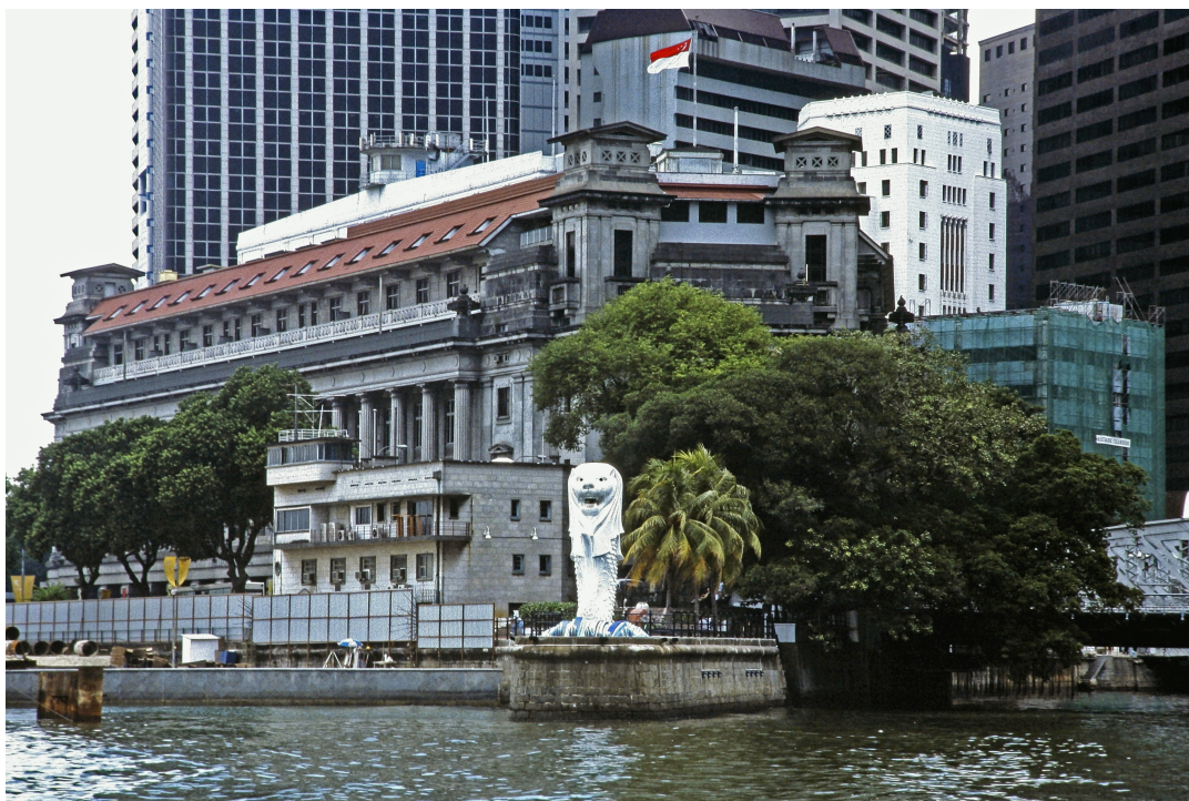
Figure 3. A 1994 photograph of the Merlion, a half-mermaid-half-lion figure that is the official mascot of Singapore and is used for promoting Singaporean tourism. At this point in time, the Merlion still stands at its original location, close to the site of the Singapore Stone (Tichy 1994).

The original location of the Stone, the Rocky Point, continued to be a significant location in Singapore even after the Stone's removal. Fort Fullerton would eventually become the Fullerton Hotel, an icon of the Singapore bay's skyline. The original location of the stone would also play host to another symbol of Singaporean culture—the Merlion, a half-mermaid-half-lion figure formed to promote Singaporean tourism. An 8.6 m statue of the Merlion was erected in 1972 near the original site of the Stone Figure 3 before being moved away in 2002 (Figure 4) when construction of a bridge obscured its view of the bay (Khoo 2000).