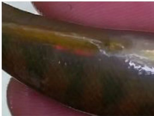
Figure S1. Adult Candy Darter male (a) and female (b). Red visual implant elastomer tag on dorsal surface of Candy Darter (c).