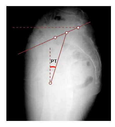
Figure 2. Method of measuring pelvic alignment. Pelvic tilt angle (PT) is measured as the line drawn from the center of the superior endplate of S1 to the femoral head.

Figure 1. Method of measuring spinal alignment. Thoracic kyphosis angle (TK) is measured from the superior endplate of T1 to the inferior endplate of T12; Lumbar lordosis angle (LL) is measured from the inferior endplate of T12 to the superior endplate of S1.