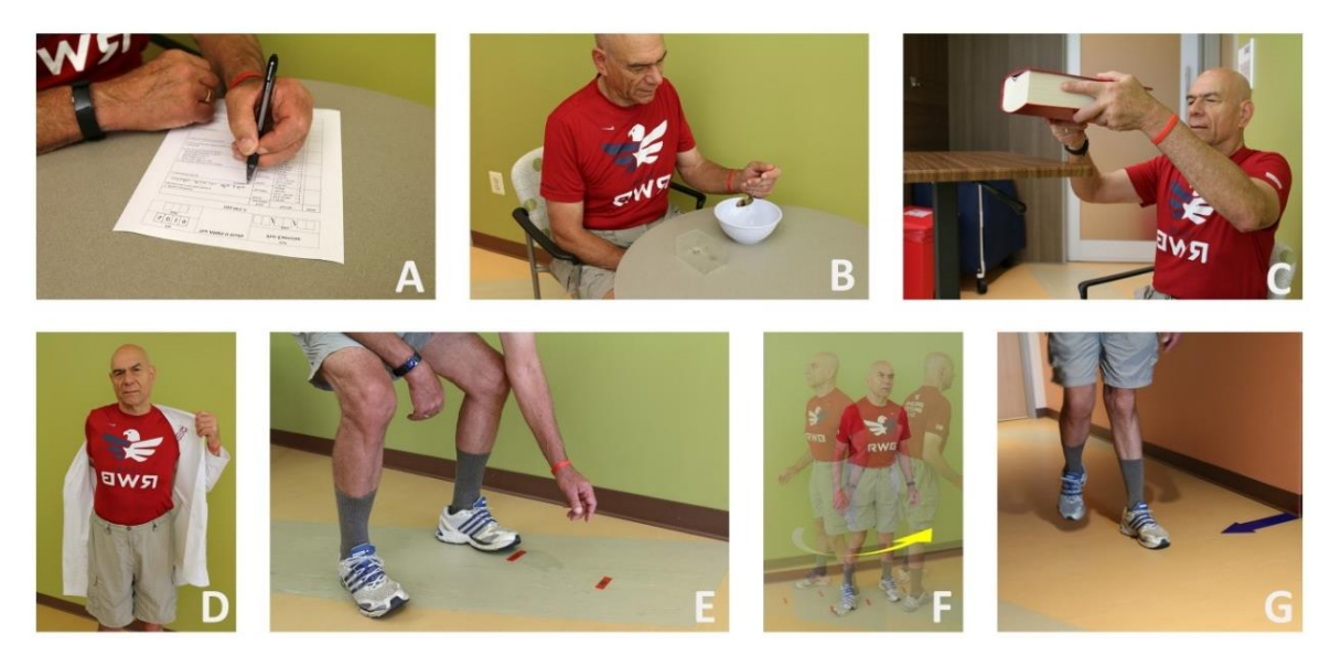
Figure 1. The 7-Item Physical Performance Test. The Physical Performance Test (PPT-7) is a performance-based functional assessment battery for older adults. The PPT-7 tasks include: ( A ) writing a sentence, ( B ) simulated eating, ( C ) lifting a book (approx. 3.2 kg) and placing it on a shelf (30.5 cm above shoulder level), ( D ) donning and doffing a jacket, ( E ) picking up a penny off the floor, ( F ) completing 360^{\circ} turn, ( G ) and walking 15 m.