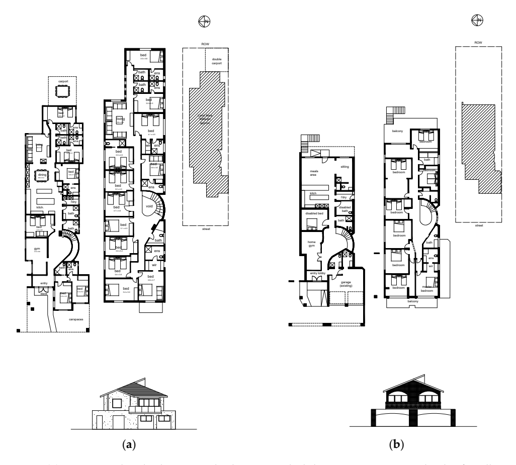
Figure 1. (a) Supersized 18 bedroom, 18 bathroom Airbnb house in an inner suburb of Melbourne, Australia. Drawing by Jacqui Alexander. (b) Existing conditions plans and elevation drawings as documented in the original planning submission, with a total of nine bedrooms. Drawing by Jacqui Alexander.

AUD$70.00 per night. At maximum occupancy, the house is capable of generating around AUD$8800 p/w in rent, or around 14 times the average income for a rental property in the area.