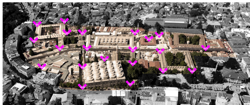
Figure 2. Detailed map of SPL measurement locations (adapted from Bursa Site Management Unit, 2013) [24].

Next, the sound sampling process was performed at the twenty-one pre-defined points (Figure 2), including various sounds, i.e., site users' chats, footsteps, business owners' shouts, surrounding traffic, birdsongs, water, etc. (Figure 3 shows photos of these areas.) The sound pressure levels (SPLs) were collected at different time intervals, i.e., mornings, afternoons, and evenings of weekdays and weekends, to understand the temporal variations in the sounds. Following the literature, the SPLs were collected at three time points to holistically understand the sound attributes [21–23]. Thus, we collected SPLs between 8 and 10 a.m. (morning representation), 12 and 2 p.m. (noon representation), and 5 and 7 p.m. (evening representation).