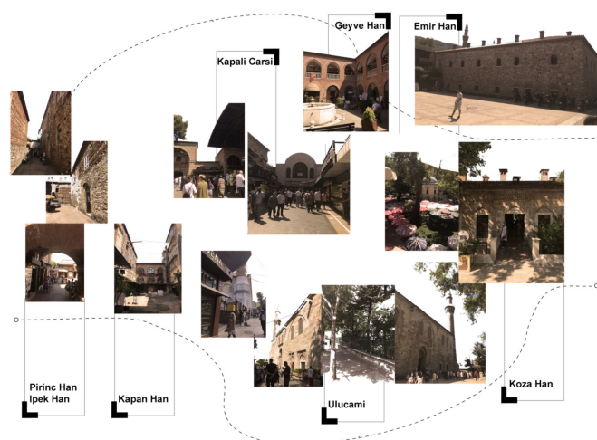
Figure 3. Photo collage from the SPL measurement locations.

Based on the ISO standards and the procedures used for other studies, the SPL measurements were conducted using a PBX LXTI Class I Professional SPL meter by recording fifteen-minute sampling ( L_{eq} 15 min) in each location in dB(A) parameters. Following the ISO standards and the literature, the sounds at each location were measured during three time intervals and on weekends and weekdays (which resulted in a total of six measurements for each measurement point); the measurements were recorded at a 1.5 m height from the ground and away from the facades and curbs to prevent the sounds from reflecting off the ground and wall [22,25,26]. The measurements included some parameters, including LA_{eq} , LA_{min} , and LA_{max} , and a total of 756 measurements were eventually performed.