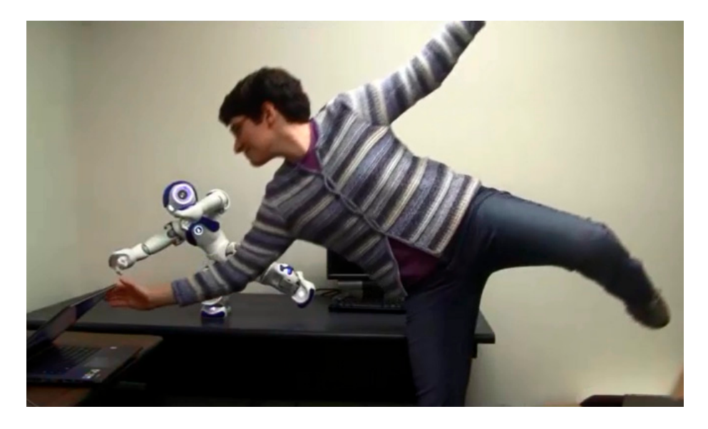
Figure 3. Dance freeze game for kids with autism spectrum disorders. Participants experienced human partner and robot partner for the game.

Dance involves visual, auditory, and tactile modalities and it is familiar and fun to most people. Because of these characteristics, researchers envisioned that dance can be used for pedagogical and therapeutic purposes, with a range of disorders from autism spectrum disorders (ASD) to schizophrenia. Indeed, the recent research attempts to use dancing robots for children with ASD. An ongoing research study (Figure 3) attempts to use a "dance freeze" game to facilitate social interactions of autistic children [42].