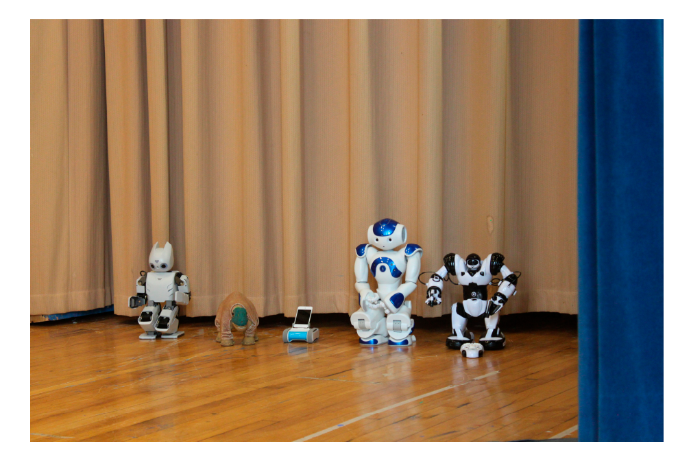
Figure 1. Robot theater program as part of an afterschool program at local elementary school. Children wrote the scenario, made props, and played live theater with robots.