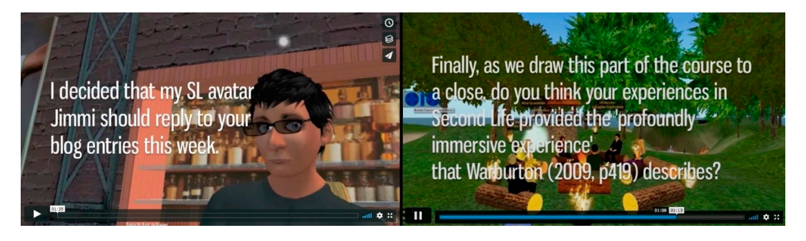
Figure 2. Stills from video feedback recorded in Second Life.