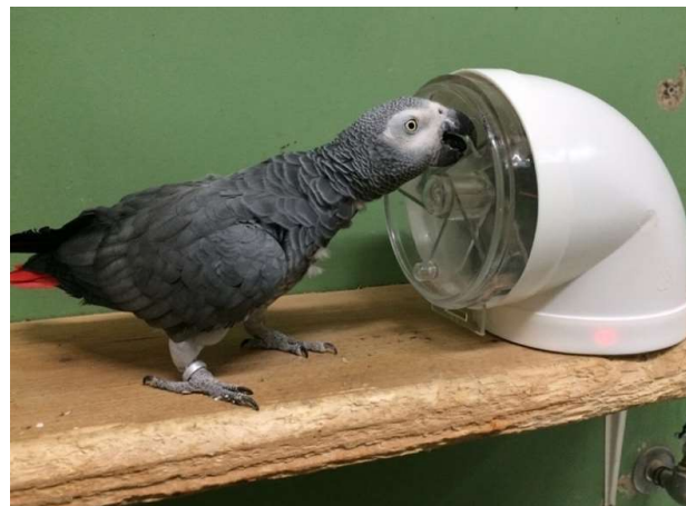
Figure 5. DJ instrument played by grey parrot Pauli.

the wheel, it scratches through the loaded audio file. Depending on the speed and duration of the rotation, different scratching sounds, similar to DJs' vinyl scratching, are generated. The instrument is battery-powered and can be easily installed at different locations and therefore in the different territories of the individual grey parrots in the aviary. In general, grey parrots are very territorial animals, and therefore individual birds were not always free to move within the aviary. The mobility of the instrument compensates for this behavioral limitation.