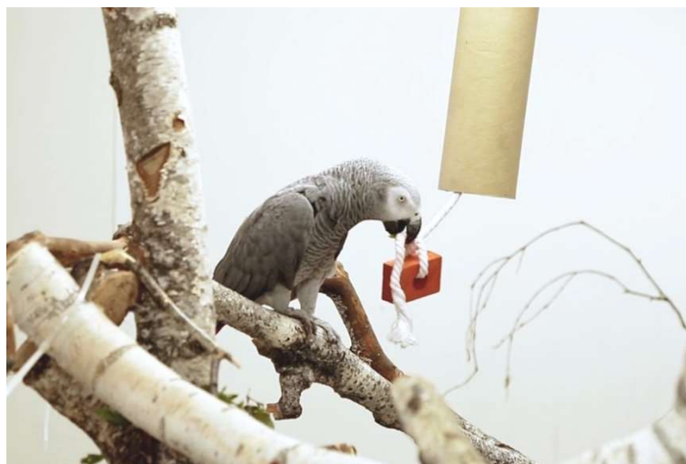
Figure 3. Rosi playing the chime instrument.

This simple and purely acoustic percussive instrument (Figure 3) is based on a wind chime with the audible musical notes G-A-B-D-A-G-B-D. The eight tones are produced by eight metal rods within a cylinder which are struck by a disk attached to a cord with a wind sail.