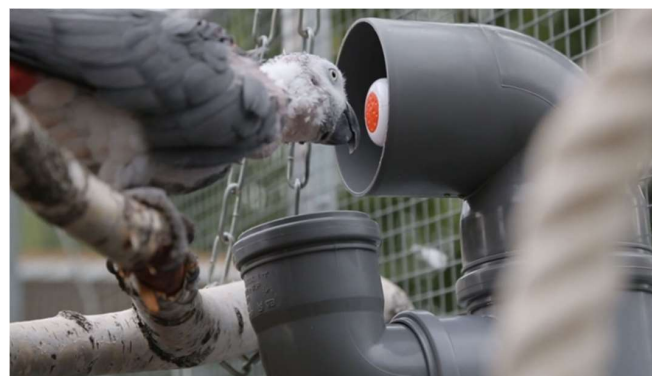
Figure 7. Cocomiso interacting with the vox instrument.

The vox instrument (Figure 7) consists of a plastic pipe system with three openings. A children's microphone is mounted to the larger open end and receives the sounds of the parrots. At the other two smaller open ends, small speakers are installed for a direct sonic feedback. The necessary electronics such as a Raspberry Pi, soundcard and amplifier board were also built into the pipe system. Once the microphone registers sound from the grey parrots, these sounds are slightly delayed and transformed by the instrument. The intended result is a call-and-response interaction between the grey parrot and the instrument that involves different sonic elements, such as reverb, echo and pitch shift.