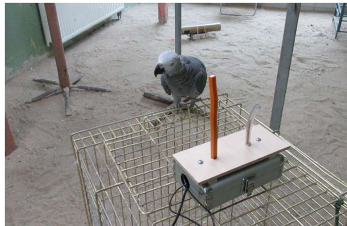
Figure 8. Prototype for a drum sequencer instrument with bending ruler.

Another design idea involving the construction of a drum sequencer instrument is based on the outstanding rhythmic entrainment capabilities of grey parrots. The reel instrument is intended to be used by the parrots to generate rhythmic patterns. We have observed that some parrots bob their heads to continuous beats of music. Thus, this drum machine instrument could encourage and promote this behavior. The first experimental approach towards such an instrument utilized bending rulers, which allowed the parrots to modify different beats and rhythmic patterns by bending flexible rulers. Tests with this bending ruler prototype (Figure 8) were not satisfactory. Although the parrots were interested in interacting with the rulers, they had difficulty bending the rulers with the integrated sensors to trigger the sound. Therefore, we had to rethink the interaction concept.