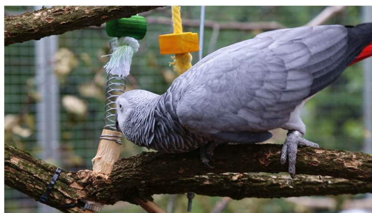
Figure 4. Nepomuk and detail of the branch instrument.

The branch instrument (Figure 4) is an electroacoustic instrument that makes the grey parrots' interactions with the branch and the additionally attached ludic elements audible. As described above, branches are always used for enrichment in the parrot shelter aviary. The parrots sit and move on the branches, peel off the bark and rub their beaks or knock on the wood. We chose a branch from a regional elderberry shrub because we thought its particularly soft wood and soft bark would stimulate the interest of the grey parrots in destroying the branch. By building piezo microphones into the branch, the instrument made the grey parrots' interactions with the branch audible. Additionally, to encourage playful interactions with the instrument, a metal spring was mounted, which could be used to make additional sounds with the two wooden cubes mounted on a cord next to the spring.