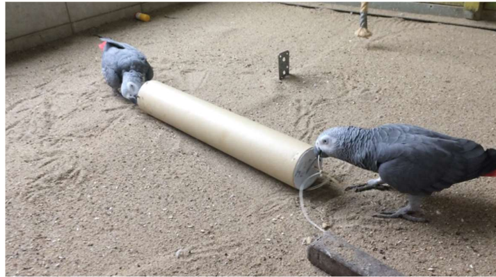
Figure 6. Tube instrument showing a collaborative interaction.

and destructive experience and also responded to the sonic reverberations generated by their activity. We observed that the grey parrot Bimboli fluffed his feathers when interacting with the instrument, a behavior that animal experts interpret as a sign of positive excitement.