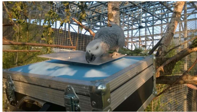
Figure 2. Billy playing the gong instrument; © alien productions.