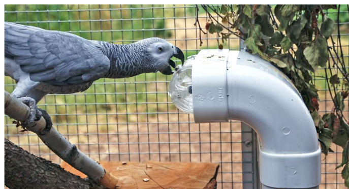
Figure 9. Wittgenstein on reel instrument. Screenshot from video by Elisa Unger.

The following concept of the reel instrument (Figure 9) is like the DJ instrument in that it is based on an enrichment toy for creating a challenging and playful process for the parrots. With this toy for physical and cognitive enrichment, the parrots must turn four wheels with their beaks to collect their treats. We equipped the four wheels with magnets that could individually activate reed switches to trigger different sounds. As previous experiments have shown, percussive sounds are well-received by the grey parrots and therefore we used drum sounds for this instrument. Each of the four wheels has been assigned a specific drum sound. By turning the wheels, the individual sounds are triggered, and turning different wheels allows the parrots to generate rhythmic drum sequences. The instrument includes a Raspberry Pi computer, an Arduino board, an amplifier and a speaker for direct sound feedback. Grey parrot Wittgenstein and others showed interest in interacting with the device and used it. The grey parrots triggered different drums sounds and responded with bobbing their heads and utterances.