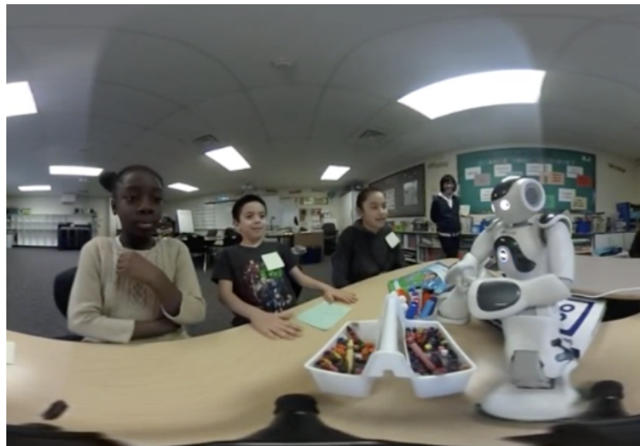
Figure 4. In this image, the three students are facing the social robot and one girl stares at the robot and appears shocked or frightened with her arm across her chest.

Finally, in a nice illustration of supporting one another in sharing feedback, one student interpreted for another student in order to share her feedback which allowed a third student to chime in with his agreement.