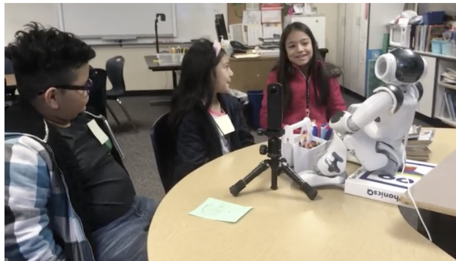
Figure 3. In this image, the three students are engaged in conversation with one another.