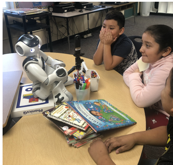
Figure 2. In this image, a student can be seen covering his mouth in surprise or shyness and simultaneously social referencing another student for confirmation about what to do next.

Although the intention of leading small group discussion with ELLs is to encourage confidence and increase language practice, a common shyness or quietness of the students occurred during the robot interactions. The speechless pattern was primarily evidenced by many behavioral examples of students covering their mouths, or hesitating to respond during the interaction. One student jumped back a bit, as if startled, when Nao first spoke to her [P5, F]. Some students covered their mouths in response to the robot asking them to respond, possibly out of shyness or surprise. In one example [P10, P11, P12] all three students covered their mouths when Nao's eyes and body illuminated during warm-up and began to turn its head toward each student. There was a shared excitement and curiosity among the students covering their mouths in anticipation of the robot's next movement or response. See Figure 2.