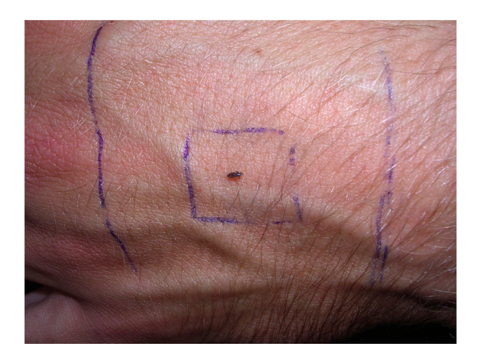
Figure 1. Head lice movement study I. Hair growth direction on the left hand counter-clockwise, on the right hand clockwise.

Lice were observed for up to 10 min; when a louse passed a line, it was removed. Thirty individual lice were used for each hand and position, giving a total of 120 lice. The direction of hair growth on the left hand was counterclockwise and on the right hand clockwise.