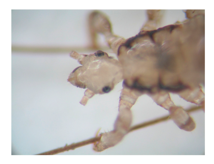
Figure 4. Head lice movement study IV—head louse after amputation of the distal antennae.

We performed Study IV to observe orientation of head lice with and without antennae. The distal parts of both antennae of 43 adult lice were amputated with a scalpel blade under a dissecting microscope, by cutting against a hard surface (Figure 4). Only 25 lice survived this procedure and these were used to study direction of movement for three positions of the upper limb: horizontal, vertical hand-highest, and vertical hand-lowest. Lice were positioned individually on the center of the forearm of a female investigator and tested for all three upper limb positions. Direction of movement of lice was observed. The control group of 25 lice had intact antennae.