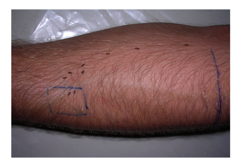
Figure 3. Head lice movement study III. Movement of head lice on unshaved forearm, against direction of hair growth (clockwise).