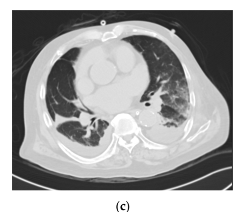
Figure 1. Strongyloides hyperinfection associated with gas-forming spondylodiscitis and E. faecalis bacteremia. (a) Transverse view of the computed tomography scan of the abdomen, demonstrating gas-forming spondylodiscitis. (b) Coronal view of the computed tomography scan of the abdomen, demonstrating gas-forming spondylodiscitis. (c) Bilateral pulmonary infiltrates noted on the computed tomography scan of the thorax.