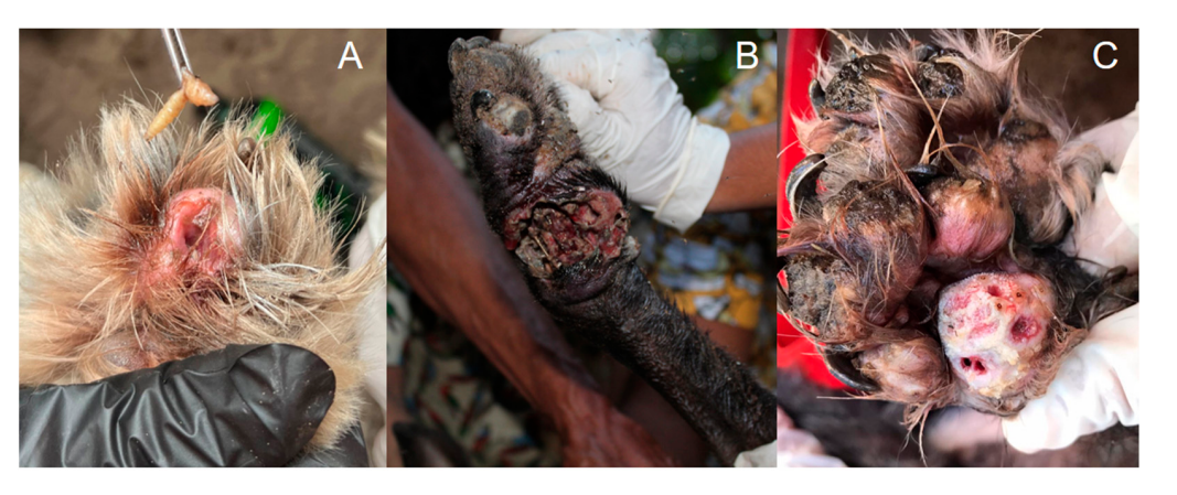
Figure 4. Complications of canine tungiasis. ( A ) Presence of myiasis in a lesion caused by T. penetrans in the paw of an infected dog. ( B ) Dog paw with tungiasis associated with secondary bacterial infection with necrotic tissue. ( C ) Dog paws with T. penetrans lesions showing suppuration and secondary infection.