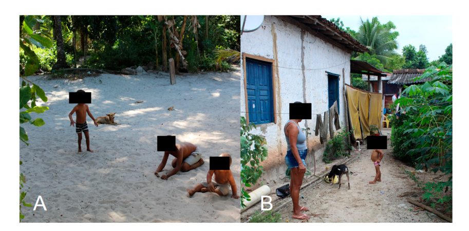
Figure 3. Relationship of environment, animals, and humans in a Brazilian community that is endemic for tungiasis. ( A) Barefoot children playing on sandy soil next to a dog with tungiasis. ( B) Barefoot child next to an infected dog.

The climatic factor is also a significant challenge, since in some regions, the parasite's presence and reproduction occur in all seasons of the year [41], unlike others where peak infection mainly occurs in the dry period [42]. Thus, in regions with no seasonality for the disease, care needs to be constant, demanding higher investment and a better control strategy by public authorities and the affected population.