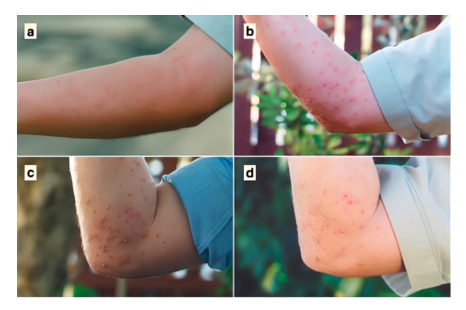
Figure 2. Pseudo pustule clinical progression of red imported fire ant stings (hallmark sign). ( a ) Five minutes after the event, showing raised welts at sting sites; ( b ) 18 h after, showing typical pustules; ( c ) 48 h after; and ( d ) seven days after the event (Solley et al. 2002) [37].