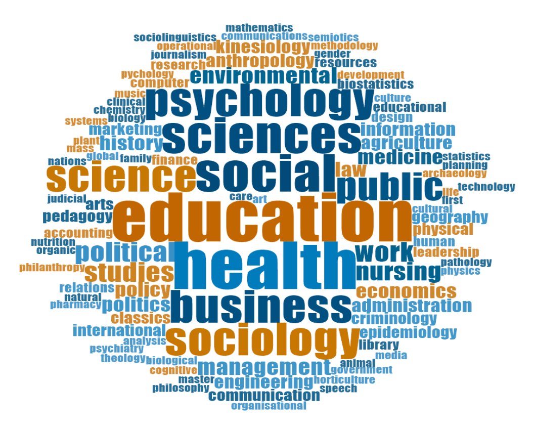
Figure 2. Students' disciplines and subjects.