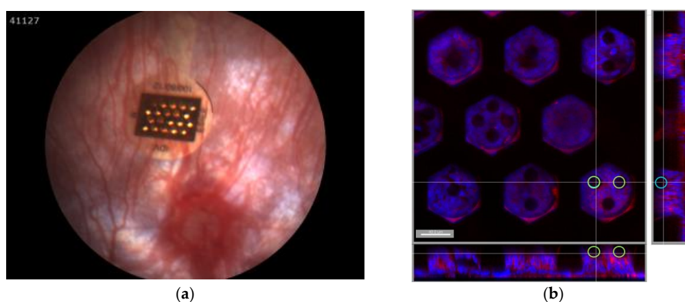
Figure 3. (a) Verification of the correct placing of the implant in sub-retinal position two weeks after implantation: Eye fundus of P23H rats with the implant obtained with a Micron III; (b) Confocal image of the retinal tissue and implant, where blue cells represent the bipolar cells after 19 weeks.

The digital endoscope (Figure 3a) and OCT images taken during the whole implantation period can show that the implant is properly placed in the sub-retinal position. A confocal analysis of the explanted tissue allows us to check the adaptation of the retina to the new implant geometry. The images obtained (Figure 3b) do not show a glial reaction of the tissue around the implant and the cells can descend into the cavities whether there are protuberances or not.