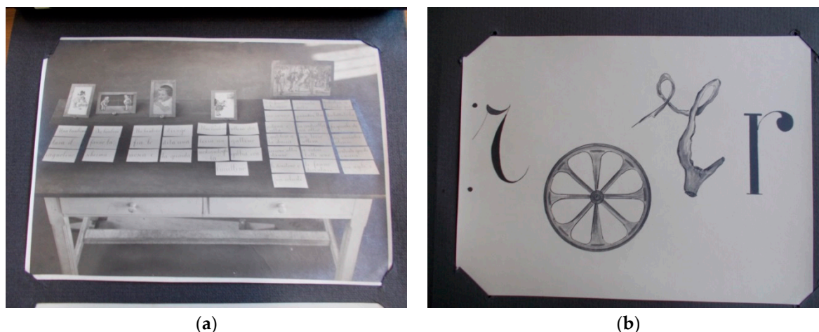
Figure 6. (a,b) Self-produced didactic aids from Padre Gemelli school (ASPG, file 3491).

For instance, in the images below it is possible to see a small blackboard, wood stick, illustrations made for reconstructing scenes in order to reproduce the same scene with the help of syllabals or wood stick (Figure 6).