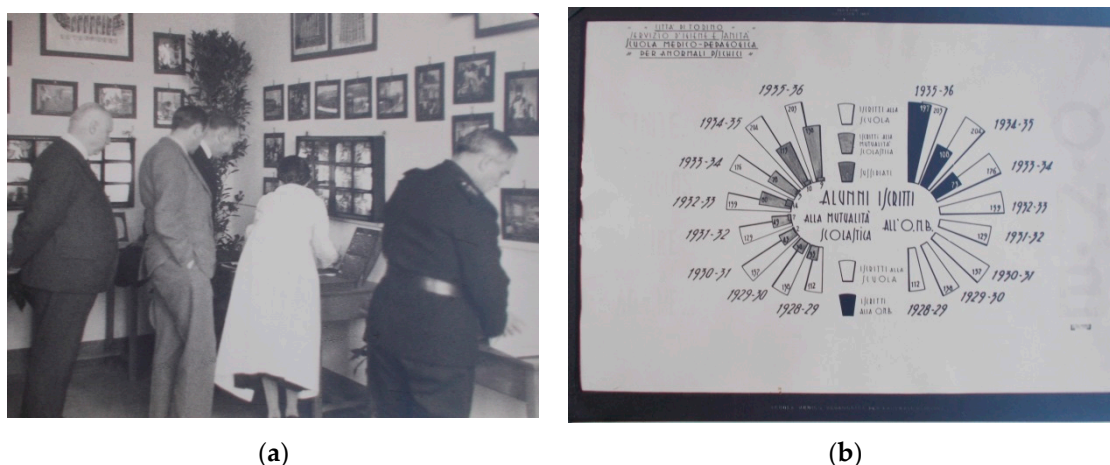
Figure 2. (a) Opening of the new school’s center: Manager’s office (ASPG, file 3488); (b) Panel representing number of students of the physician-pedagogic school of the Balilla national activity (ASPG, file 3488).

Therefore it is possible to see to the weekly hour panel, the enrolled students, the graphic representation of the treated cases of “abnormality, etiology and anamnesis of the students” in the first year of activity of the school (1928–1929) up to the year 1935–1936 distinguishing personality abnormality from the intellectual one, the mixed abnormality from the abnormality itself and their origin. A second notice-board shows the activity of the neuropsychiatry clinic not only underlining the progressive increase of activities, but also the value of the distributed medicines, and still other numerous notice-boards devoted to show the sanitary assistance granted to the students; or to the presents for the disabled pupils during the celebration of the fascist Epiphany; or to the increase of the consistence of the volumes of the school Library, with the motto “book and musket”; or to the abnormal pupils sendt to the colonies and also the number of students of the physician-pedagogic school of the Balilla national activity (Figure 2b).