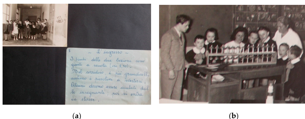
Figure 5. (a) e (b) Album about school life of Mongoloid section (ASPG, file 3496).

A specific illustrated album in a following period point out a new section dedicated to the mongoloid students. The album reconstruct precisely these students school life, their activities, the hourly scanning, the teaching method (Figure 5). The images accurate explanations in fact clarify as the use of sensorial stimulations and practical games, plastic manipulations, seams, insertion beads, clippings and theatrical activity represent the core practices, besides long walks and games.