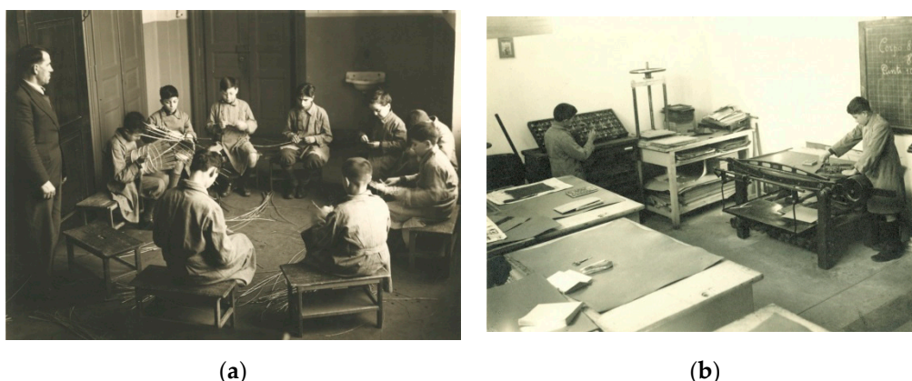
Figure 4. (a) Basket maker labs (ASPG, file 3492); (b) Typography labs (ASPG, file 3494).

The importance of images lays in gathering all the medical aspects of school life as well as the didactic and methodological issues, thus the first albums were made in the 1930s, right when a new headquarter was set and a new educational experimentation was held: the teaching is established on laboratories. As shown by the images below there were fully equipped carpentry labs, basket maker labs, feminine arts labs, pottery labs and so on (Figure 4a).