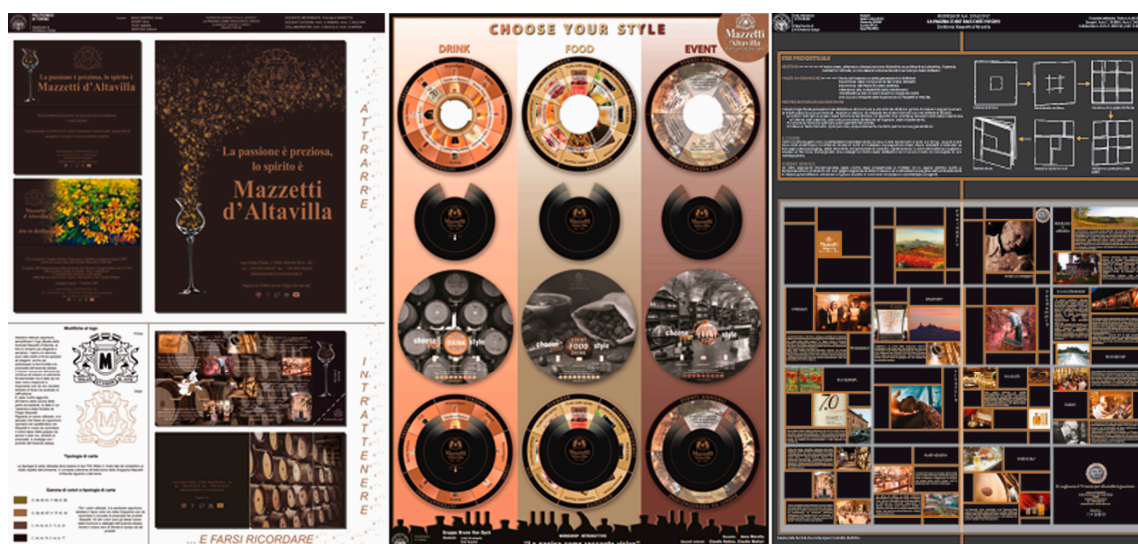
Figure 3. Three of the four promotional display panels of Distilleria Mazzetti d'Altavilla.

They include possible innovative solutions for packaging and material of the productive and cultural activities promoted by the company.