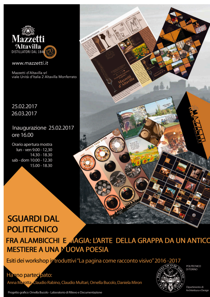
Figure 6. Flyer for the presentation of the event at Distilleria Mazzetti d’Altavilla in Monferrato. On the background, there are the soft hills characterizing the area around the distillery and on the foreground the promotional products produced. The predominant chromium refers to the color of grappa and its preciousness.

Of particular communicative effectiveness in the visual sense is emphasizing the true “photographic image” of the typical Monferrato panorama made on variations of the gray tones, which exalt geometries of the individual frames and their chromatic balance without coming into conflict with each other.