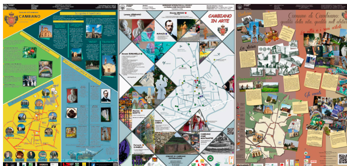
Figure 1. Three of the four promoting panels of Cambiano’s cultural heritage. They show the places of greatest historical interest, the characterizing events of the country’s culture and the artistic works disseminated on the territory.

Subsequently, territorial realities have been involved in the artistic and cultural promotion of the city: historians, artists, playful/cultural associations, traders and the municipal administration as well. Another decisive phase was the presentation to the citizens of Cambiano of the compositions, in a convincing spirit of sharing: from the “objective” information to the more evocative images, as those derived from the historical memory of the city.