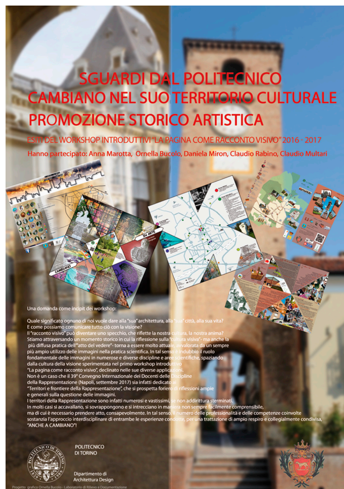
Figure 5. Presentation poster of the workshop's outcomes for Cambiano. In the background there are two architectural portals representing Politecnico and the historical center of the city. On the foreground there are details of the promotional panels and promotional brochures of Cambiano.

Further decoration elements are differently oriented panes (almost a dynamic game) showing many glimpses of the city, while in the center you can see the map with the urban paths. Of particular visual importance is—in the first square on the left—the skyline of the city, a strong sign precisely for its synthetic way of describing a unitary image of the places. The overall icon of the poster is therefore composed of so many smaller images, correlated with each other, and confirming one of the main rules of graphic composition.