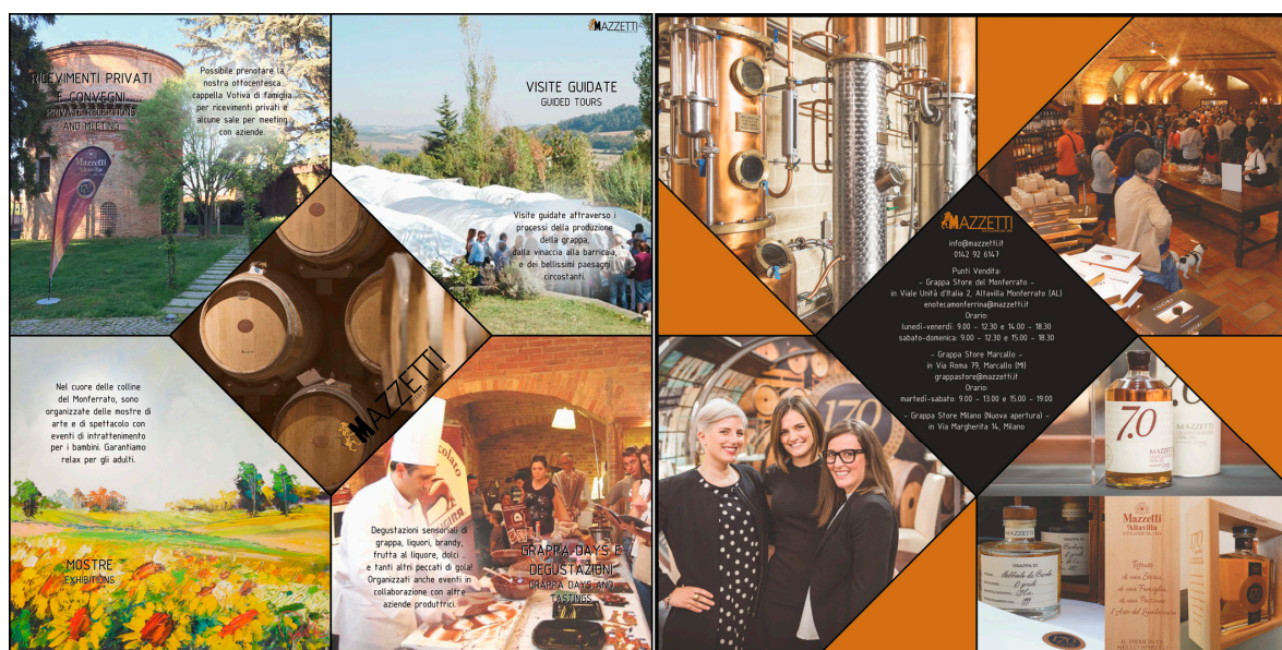
Figure 4. Front and back of one of the innovative brochures of Distilleria Mazzetti d'Altavilla realized for the promotion of cultural events and merchandise.

They include possible innovative solutions for packaging and material of the productive and cultural activities promoted by the company.