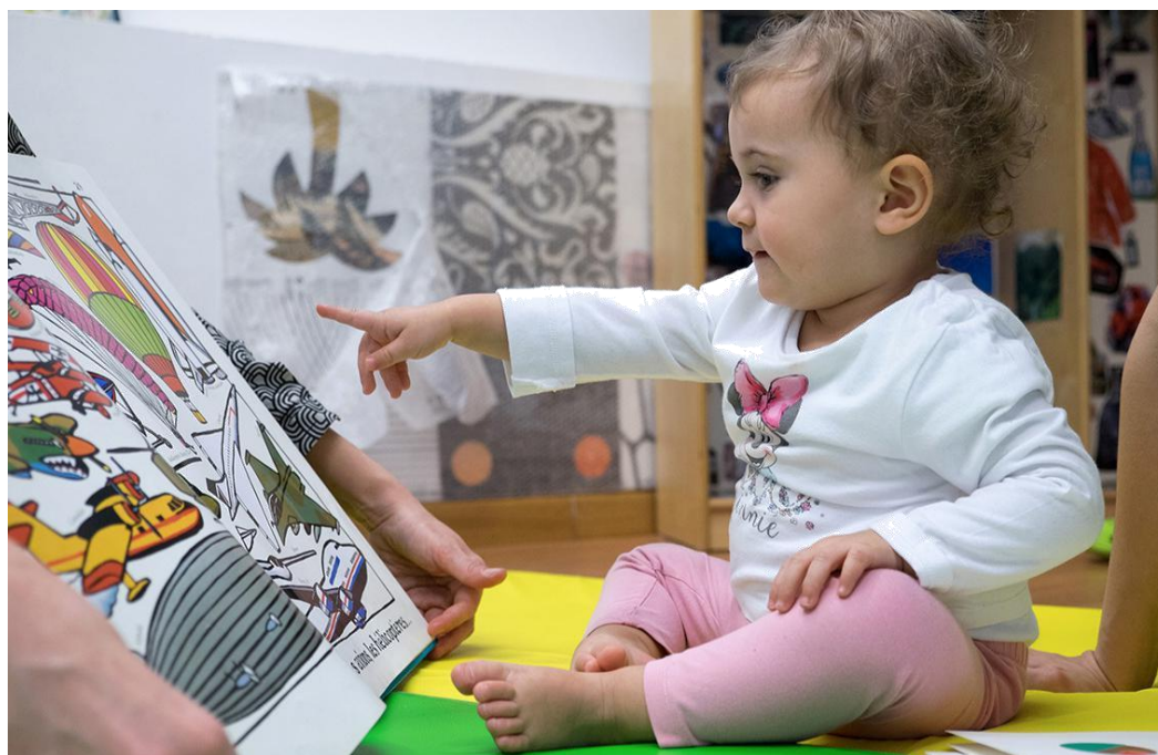
Figure 4. Picture by Elisa Vettori, "Ku-Ku! Leggere le figure dalla nascita" for the children of Asilo Nido Pineta In Crescendo, Rome, Italy, care of Giulia Mirandola.

In 2016, I asked photographer Elisa Vettori to collaborate on a project about reading from birth, to start in early 2017. We went to a nursery school every day for a week to carry out reading activities with children aged 7 to 13 months in the presence of their educators. Each session lasted 45 minutes. The groups consisted of eight children and two educators at a time. I had the role of mediating the relationship between the books and the children, the photographer took pictures of the situation. Elisa Vettori is not specialised in baby photography, she is a freelance photojournalist used to watching people and landscapes and photographing them with satisfying results. To obtain documentation for deeper analysis, it was necessary to use directed and high-quality images (Figure 4).