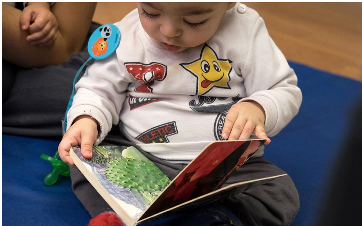
Figuer 5. Picture by Elisa Vettori, «Ku-Ku! Leggere le figure dalla nascita» for the children of Asilo Nido Pineta In Crescendo, Rome, Italy, care of Giulia Mirandola.

The rush to search for words in a book ignores its multidimensionality. Nascent readers, with their scrupulous and multifaceted method of living the reading experience, teach themselves and those who comprehend them how a concept emerges and takes form.