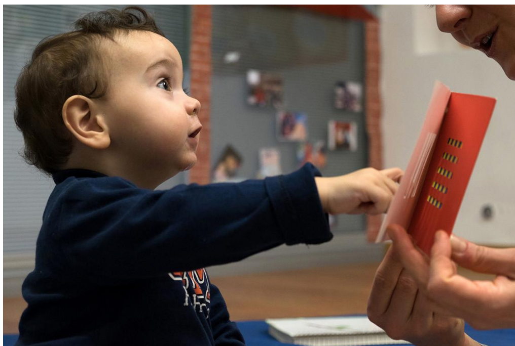
Figure 3. Picture by Elisa Vettori, “Ku-Ku! Leggere le figure dalla nascita” for the children of Asilo Nido Pineta In Crescendo, Rome, Italy, care of Giulia Mirandola.

Reading an illustrated book may seem like a paradoxical experience: our senses are engaged in an activity related to visual and tactile perception; internally we are immersed in a spatial and temporal exploration with abstraction, immateriality, subjectivity, the production of brainwaves, the orientation of attention and emotions at its core. There is no fixed (or moving) image in the world that does not seriously address the problem of invisibility, the appearance of what is not seen and how to communicate with these different types of reality (Figure 3).