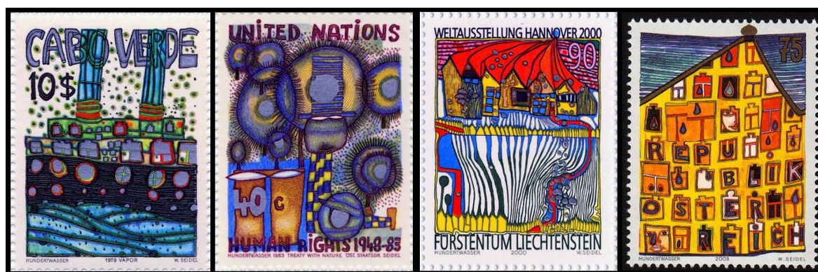
Figure 1. Hundertwasser's stamps.