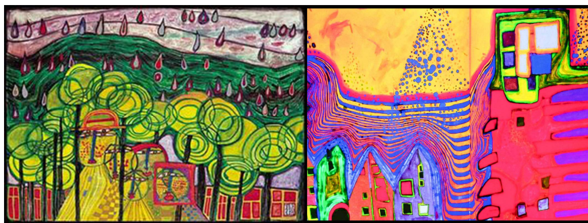
Figure 4. Hundertwasser's images with the rain.

He loved diversity and detested duplicates; he wanted each copy to be original. In fact, using a complicated process of chromatic combinations he succeeded in creating 10,000 copies from the same serigraphic matrix, changing the colour tones in each one. His work demonstrates how integration is always important during experiments performed as research since integration makes it possible to compare and find new relations that allow humanity to take one small step forward on the path of knowledge. "I feel we've come to a turning point. It's like the vault of a dome, the segments of a bulbous tower. Our starting points are different, I'm currently in the phase in which all the extremities converge. I've drawn stamps and worked as a sailor, architect, environmentalist, painter, etc.; all these activities now merge and flow into a single point. This makes me happy and justifies my work" [3].