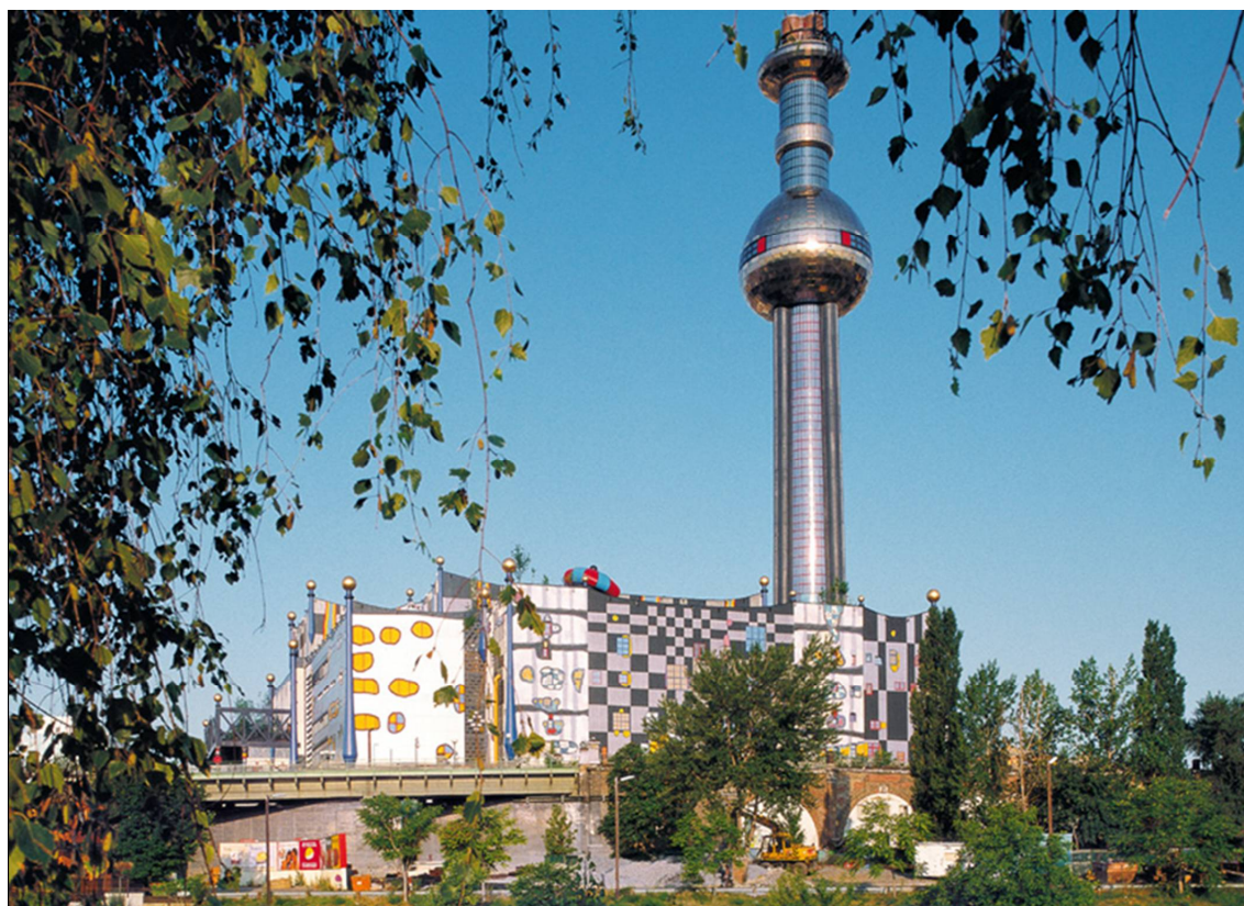
Figure 7. Incinerator in Japan.

Another very interesting project was the incinerator (Incineration Plant Osaka) built by the Austrian architect on an island in the Bay of Osaka in Japan not far from Universal Studios. Every day this incinerator burns 900 tons of waste. It was an intelligent environmental conservation project that also considered the question of perception. In fact, the extravagant building with its round forms and coloured structures looks like an amusement park (Figure 7). These very unique, unusual and different places share a common objective: to embellish and enhance the world. This characteristic has turned them into tourist attractions.