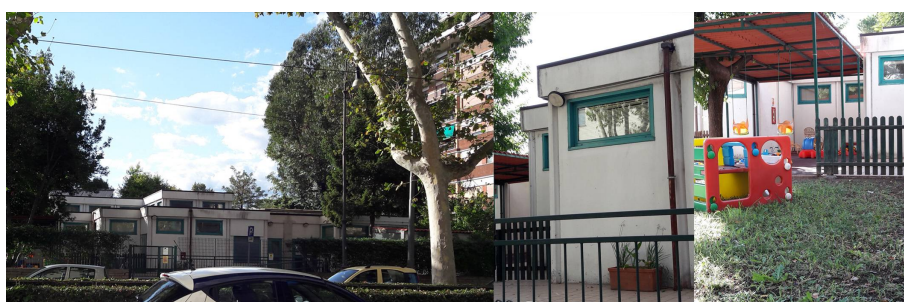
Figure 8. The Pinturicchio Kindergarten.

One of the most interesting aspects of Hundertwasser’s embellishment process is to give the user of the building free rein to decide on the work to be done. By involving and increasing manual labour while taking care of the place where one works, studies or lives not only produces a positive fallout in terms of personal change and solicitation, it also influences one’s psychic mood. The kindergarten in Viale Pinturicchio in the Flaminio district of Rome was the chosen venue for our experiment. It is a squarish, one storey prefab building in a regular lot next to Piazza Mancini, a square with a busy bus terminal (Figure 8).