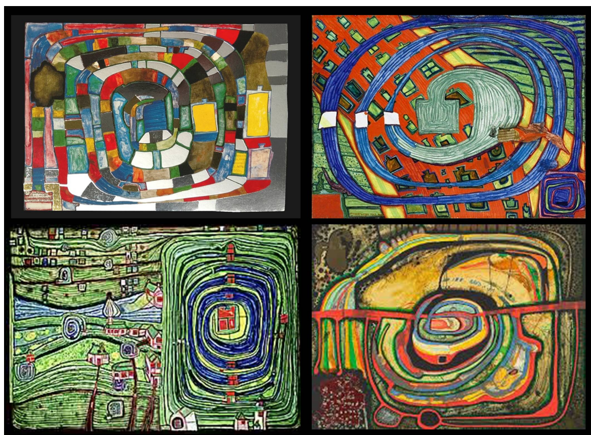
Figure 3. Hundertwasser's spiral images.

The artist-architect studied community problems, focusing in particular on the social environment. He was convinced that: "when we dream alone, it is only a dream, but when many dream together it is the beginning of a new reality" and "... if people are pessimists in our society, the artist has an obligation to the society he lives in to warn and to look for solutions" [3]. Hundertwasser's images include many round forms, circles and spirals. The latter were probably inspired by other sources: the paintings of the schizophrenic patients he visited at the University of Medicine in Vienna, or the works by Austrian Secessionists, in particular Gustav Klimt [1] (Figure 3).