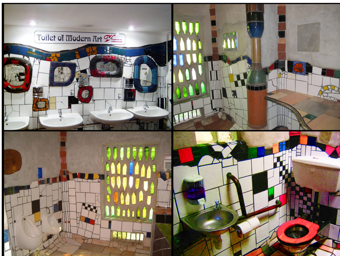
Figure 6. Interiors of the Hundertwasserhaus.