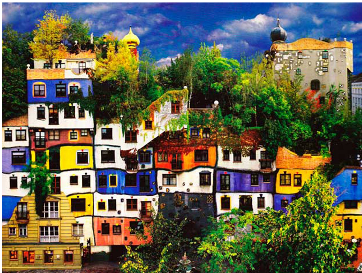
Figure 5. Façade of the Hundertwasserhaus.