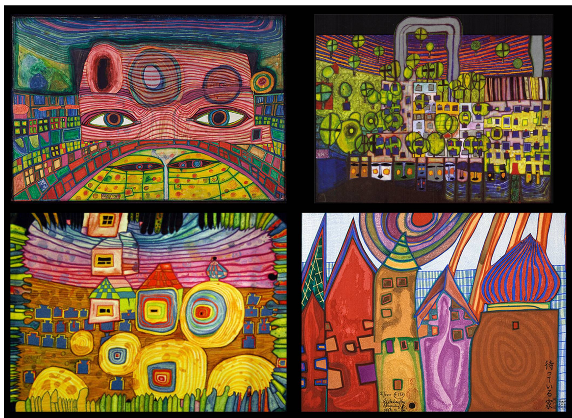
Figure 2. Hundertwasser's images.

Although Hundertwasser has been awarded numerous international prizes, he still remains a relative unknown in the artistic and architectural milieu. This contribution uses the artist's works to study his unique creative system since it can still be a valid source of inspiration. "Hundertwasser is a rare example of optimism, hope, trust in life and the power of creativity" [1]. He began his career as a painter, developing a technique known as "transautomatism", an instinctive way of painting using the subconscious, a sort of primordial trance generating abstract paintings dripping with colour and decorations. His art is a mix of ecology and dreams, emotions and imagination; the heart and soul of his artistic career is the varied, coloured, naturalness of life, an element that made him the forefather of the current environmental movement [2] (Figure 2).