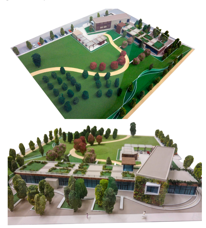
Figure 2. Physical model of the design project of the Milan Smart City Lab. The building is now in the executive design phase, while the open space still do not have a defined design project.

In the course of Architectural and Urban Simulation we tested the use of such an approach with the class. Students from the courses of study of architecture and planning developed a design project for the open area behind the Smart City Lab of the Municipality of Milan , in via Ripamonti 88, that will be built in 2018 (Figure 2). This will be a new public facility located in the south Milan, that will mainly host temporary co-working activity and will be an incubator for startups dealing with smart and sharing city solutions. The Smart City Lab and its open space will cover a total area of around 2 Ha; since this is a public facility, students were allowed to conceive the entire land as a public service.