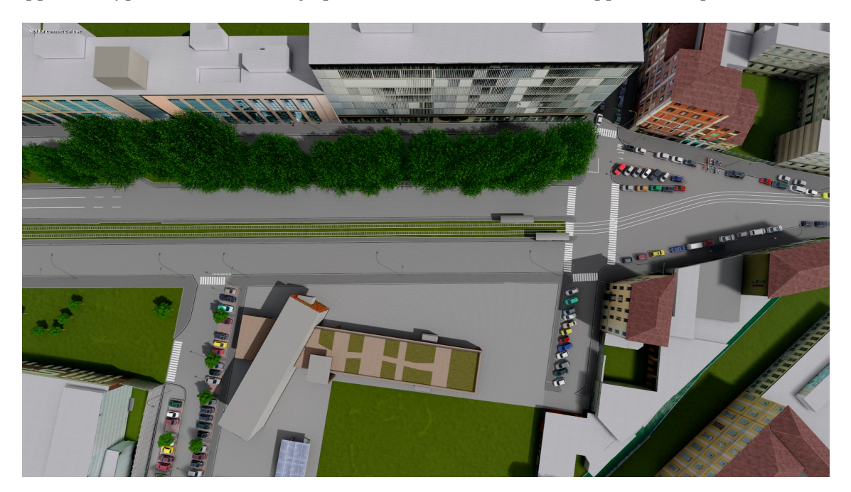
Figure 1. Render of the 3D model provided to students.

visualizations (Figure 1). We decided to use this tools because they are easy to learn and to use despite enabling high quality results in a short time. The limit of this choice is mainly related to the visualization style of Lumion<sup>®</sup>, that is peculiar and recognizable and produces visualizations that are too clean and pleasant. The modification of this fancy style is difficult to avoid, and this of course can incur a sort of bias if abused. For this reasons we tried to control this effect and we embedded the styles in the model as a reference for students. With this software it is very easy and fast to save spherical panoramas that can be presented using an HMD. Even in the choice of these devices we followed the same strategy as for software; we used cheap Cardboard where it is possible to insert smartphones of different sizes for visualizing the simulations in an interactive way. The same panorama produced for HMD can be visualized and navigate directly in the browser of the desktop pc or of mobiles. It is important to remark that the use of this tools has been intended as iterative to support the typical non-linear design process for more details on the approach adopted see [3].