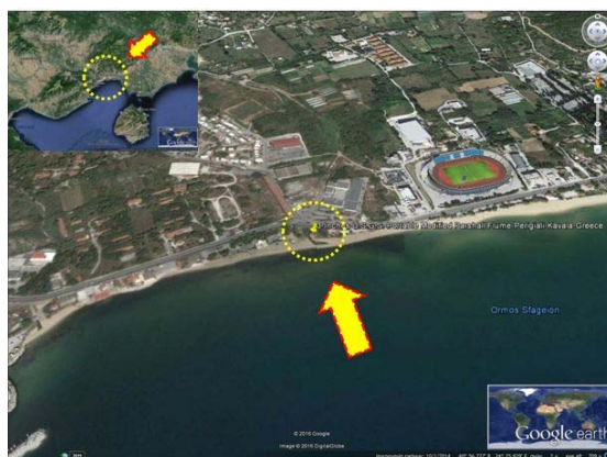
Figure 1. Parshall flumes and V-Notched weir gauging station, Perigiali Stream area, Kavala city, Greece.

The stream flow rate gauging station established in Kavala city coastal area, is located at the north of the Aegean Sea, across the Thassos Island, and surrounded by the Lekani mountain series branches to the North and East and the Paggaion Mountain ramifications to the West, (established in the proximity of the city urban web center and at the eastern exit of the city as well), located at the specific co-ordinates 40^{\circ}56'727'' N and 24^{\circ}25'929'' E, Perigiali city area, and operated continuously, bridging a time interval period from 14 May 2016 to 7 October 2017, as illustrated in Figure 1.