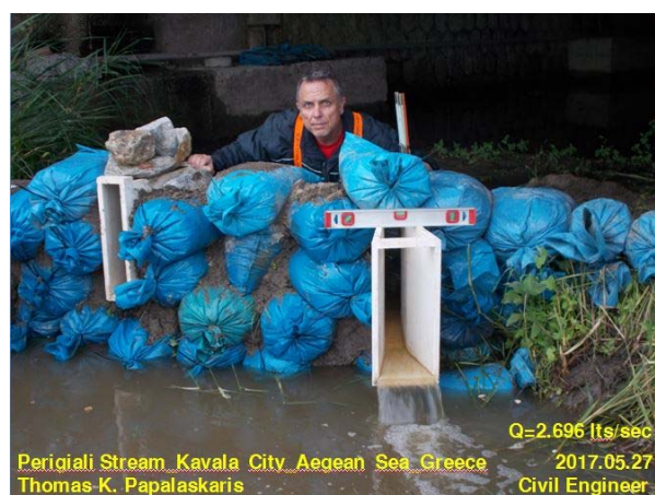
Figure 2. Parshall flumes and V-Notched weir gauging station, Perigiali Stream area, Kavala city, Greece, (see Supplementary Materials).

Low stream flow rate values were forecasted employing the Monte-Carlo method that is an appropriate type of iteration method both for meteorological as well as for river stream flow rate predictions. The fundamental procedure of the Monte Carlo method generates a certain number of trials in order to specify the anticipated value of a random variable.