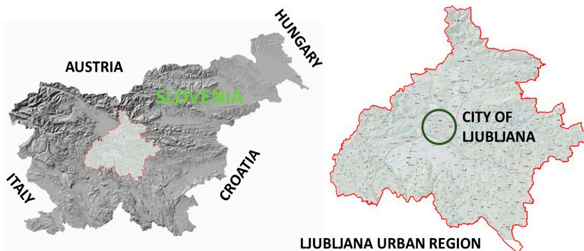
Figure 3. Ljubljana Use Case Area.

The Slovenian use case will rely on existing platforms based on NUKLEUS tool developed by LUZ, incorporating modelling and monitoring data of the LUR, such as Rivers Data (location, Flow Rate, Water Level), Soil Data, Underground Water Level Data, Slope Data, Data of urban water distribution systems—water utility networks (Capacity, Age, Location), Meteorological Data, Urban Land Use Data (current, predicted). Some of the developed platforms are open to public and some are used only by municipality of Ljubljana and their public utility companies. In the context of the Slovenian pilot, the Water4Cities will be interconnected with the existing Nukleus GIS systems used for water monitoring and urban planning. In this line, Water4Cities will provide added value capabilities to the current tools, by developing new decision support services for the identification and analysis of possible NBSs and related costs and benefits, the maintenance of water infrastructure and the empowerment of citizens through crowdsourcing capabilities.