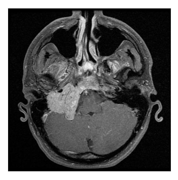
Figure 1. Axial T1 with gadolinium MRI of large right glomus jugulare.

Detailed imaging is necessary in initial assessment and management planning for HNPGL. B-mode sonography and Doppler ultrasonography are non-invasive and cost-effective first line modalities of investigation for cervical masses, but lack specificity for definitive diagnosis and treatment [2,19,44]. MRI is highly sensitive in evaluating HNPGL (Figures 1 and 2) [45]. On T1 weighted images HNPGL appear hypointense with a characteristic 'speckled' appearance. The T1 images with gadolinium enhancement show early uptake owing to the marked hypervascularity of the lesions, with serpentine flow-voids giving a characteristic 'salt and pepper' appearance [2,45–47].