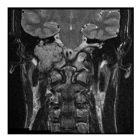
Figure 2. Coronal T2 with gadolinium MRI of the large right glomus jugulare showing numerous vascular flow voids.