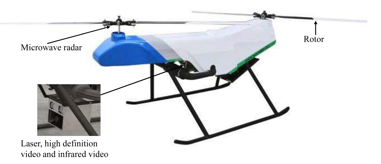
Figure 1. The drone used in LY100 fire extinguishing system.

can ensure flight safety and stability in the wind with a speed 12 m/s. The drone consumes 16 L of fuel per hour, and it can fly for nearly 2.5 h at its full load (255 kg).