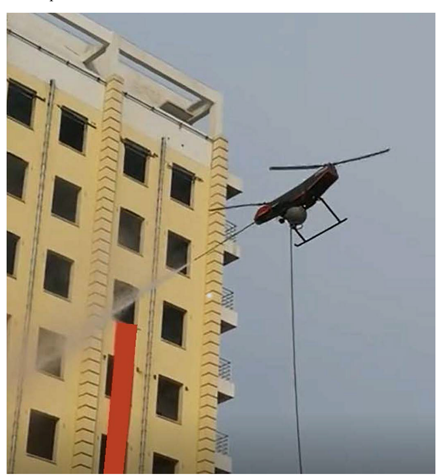
Figure 5. The fire extinguishing equipment at high heights.