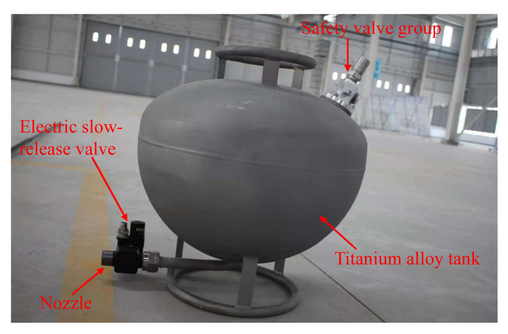
Figure 2. The pressure fire extinguishing equipment.

Pressure fire extinguishing equipment is another fire extinguishing equipment of the LY100 system, which is used for the fast suppression and flexible extinguishing of fierce burning fire. As shown in Figure 2, it is mainly composed of a titanium alloy tank, safety valve group, electric slow-release valve, hose and nozzle. The titanium alloy tank can carry 30 kg of ultrafine dry powder or 60 L of a high-efficiency water-based fire extinguishing agent. The working pressure of the tank is 1.2 MPa, the blasting pressure is 2.0 MPa, and the residual quantity of the extinguishing agent is no more than 3 percent of the total amount. The safety valve group has the functions of overpressure relief and emergency rapid relief, which can keep the flight of drone safety. The electric slow-release valve can open and close the equipment in 3 to 5 s.