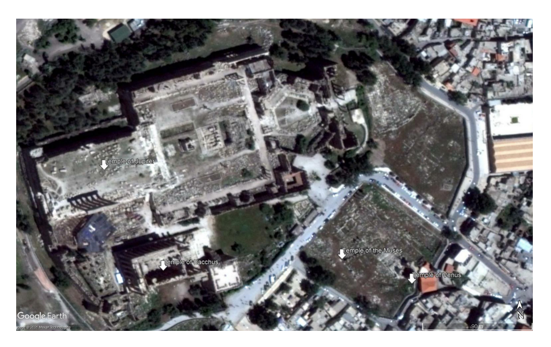
Figure 2. The temples of Baalbek (Image courtesy of Google Earth, editing by the author).