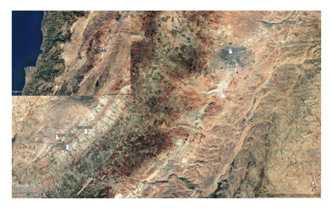
Figure 1. Positioning of the Bekaa Valley with respect to the Lebanese capital Beirut (upper left) and the main sites mentioned in the text (Image courtesy of Google Earth, editing by the author).