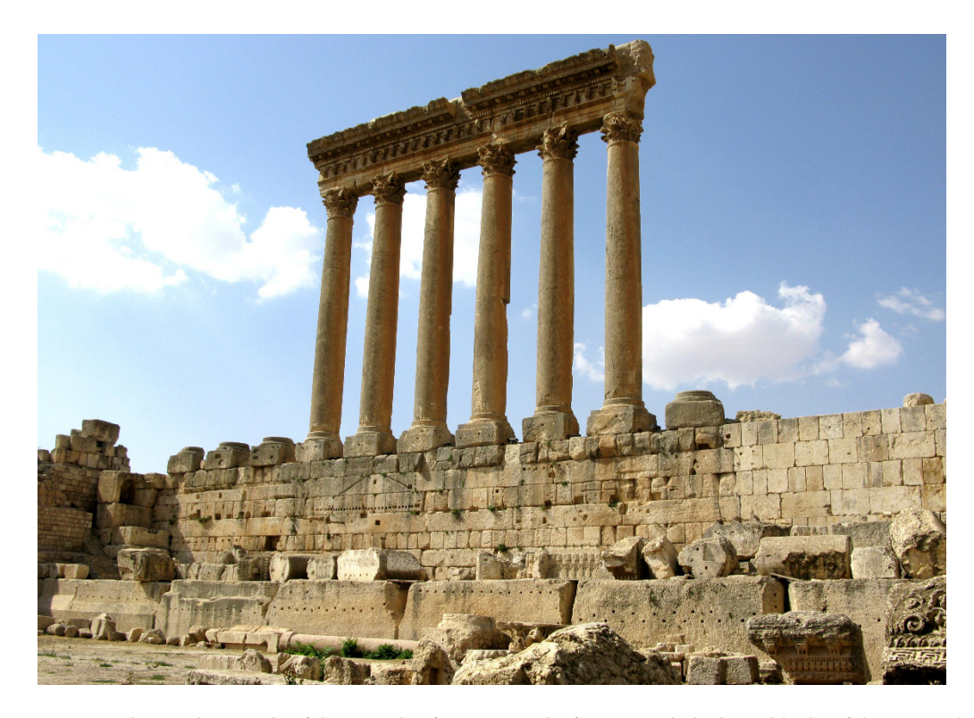
Figure 3. The southeast side of the Temple of Jupiter. In the foreground, the huge blocks of the external wall, almost identical in shape and size to those of the Western tunnel in Jerusalem. The podium, with squared masonry, is also very similar to Herodian walls on the Temple Mount.