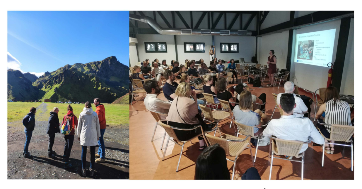
Figure 3. The knowledge exchange activities.

The results are presented according to the planned knowledge exchange methodology. This section describes the series of events (see Figure 3) together with the results from the surveys.