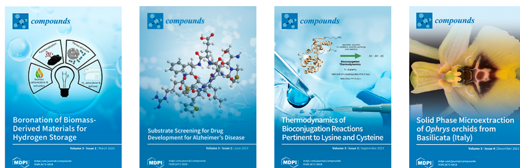
Figure 1. Cover stories for Volume 3 issues [2–5].

Last year, we reached important new milestones that encouraged us to continue the work carried out so far. In 2023, we added a cover story to each issue to improve the visibility of the featured articles (Figure 1). The cover stories corresponding to the four issues have been dedicated to “Boronation of Biomass-Derived Materials for Hydrogen Storage” [2], “Enzymatic Screening of \beta -Amyloid Precursor Protein-Based Substrates” [3], “Thermodynamic Overview of Bioconjugation Reactions Pertinent to Lysine and Cysteine Peptide and Protein Residues” [4], and “Composition of the Scent in Some Ophrys Orchids Growing in Basilicata (Southern Italy): A Solid-Phase Microextraction Study Coupled with Gas Chromatography and Mass Spectrometry” [5].