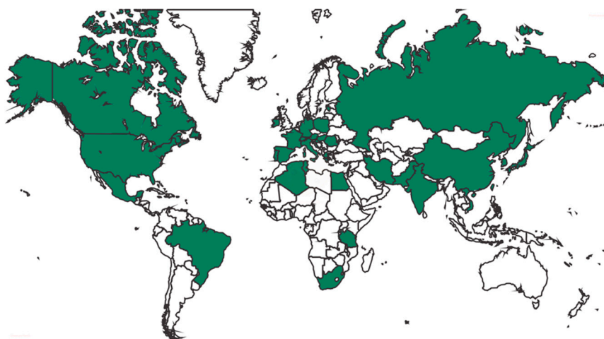
Figure 3. Geographic distribution of the authors who have participated in Compounds (2021–2023).

Another issue to underline is the international expansion of Compounds , diversifying the geographical origin of the authors who have participated as the journal has developed (see Figures 3 and 4). This is another achievement of which we are proud.