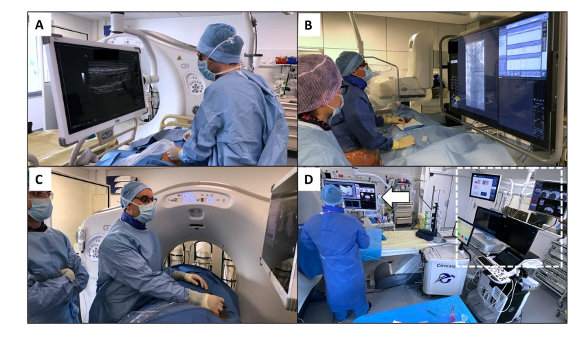
Figure 3. During procedures performed under ultrasound ( A ), X-rays ( B ), or under computed tomography scan ( C ), the screens should be placed in front of the operator to allow a downward viewing angle of 10–15°, which improves the position of the operator's cervical spine during the whole procedure. Ceiling-mounted monitors can be placed in a wide variety of positions while gathering all the information needed by the operator, including the electromagnetic navigation system, and reducing the congestion of space ( D , arrow). Head and body movements used to navigate and search among the screens of all the systems required are therefore limited (to the right, as shown by the dashed line).