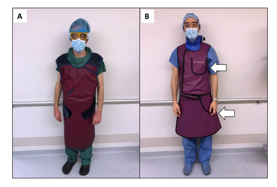
Figure 2. The lead apron is a heavy piece of radiation protection that should be worn by all staff working in the angio suite but it increases the risk of musculoskeletal disorders ( A ). A lighter two-part coat (arrows) helps to distribute the weight across the shoulders and waist and must fit properly to improve radiation protection ( B ).

However, attention must be paid to avoid uncomfortable body positions while using such devices because of the reduction in space. Leaded glasses with large lenses and protective side shields are also recommended but adoption is limited due to their weight and discomfort.