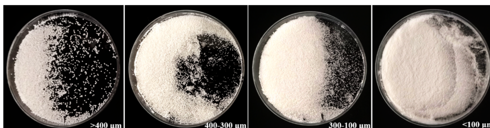
Figure S1. Image of DZ with different granule size ranges.

Means (N = 3) within the same column followed by the same letter are not statistically different (P < 0.05) according to Duncan's new Multiple-Range test.