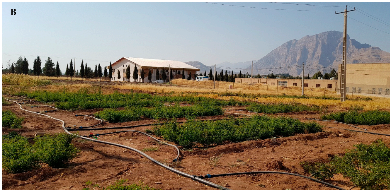
Figure S1. The experimental layout (A), and field (B), where this study was conducted. Each plot contained four lines of 10 plants. At each plot, measurements were performed on three randomly selected plants situated at lines 2 and 3. In each plant, three separate measurements were obtained. The average of these nine measurements per plot was further treated as a single replication. For taking observations, three plots were analyzed.